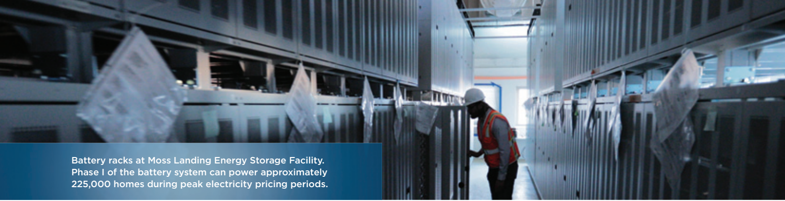
Battery racks at Moss Landing Energy Storage Facility. Phase I of the battery system can power approximately 225,000 homes during peak electricity pricing periods.

now totaling nearly 450 MW/1,745 megawatt-hours of energy storage. Vistra's Moss Landing Energy Storage Facility, the largest of its kind in the world, connected to the power grid and began operating on Dec. 11, 2020.