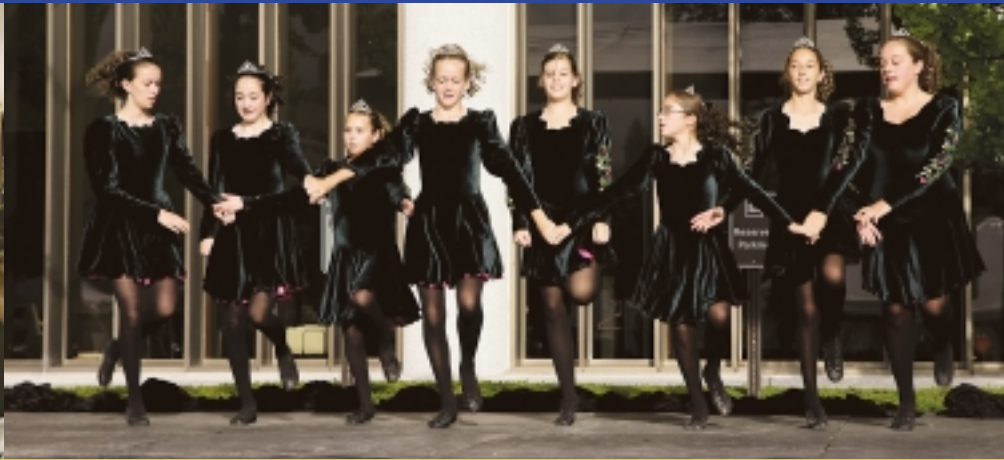
A Community Festival