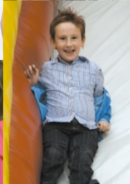
Fourth of July Celebration at Eldridge Park