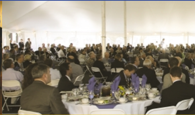
175th Anniversary Celebration