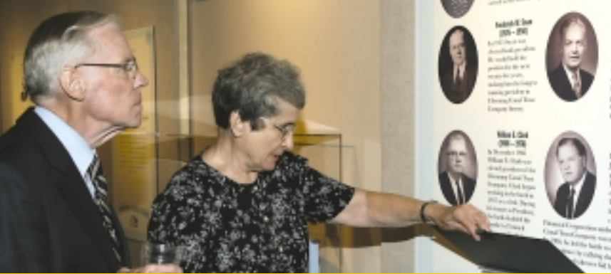
"Business After Business"