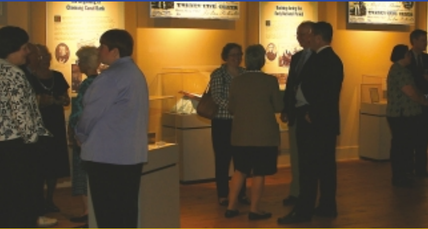
Historical Society Exhibit