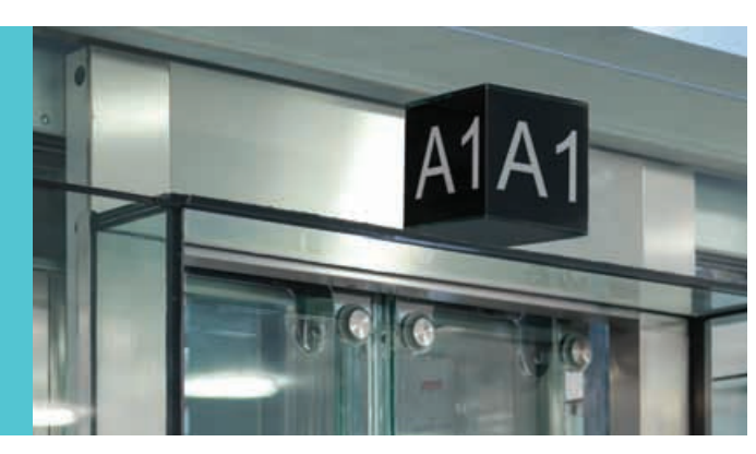
The Cube Lift Identifier provides all round visibility for Destination Control Systems with large lift lobbies.

There has been significant focus throughout the year on trying to make sure that our products are as quick and simple to install as possible. We now have a large number of jobs where customers free issue us their pushbutton control printed circuit boards. We then fully wire everything up, so that when our car stations arrive on site all the lift company needs to do is to connect up to the connectors on these boards and the installation of the car station is complete.