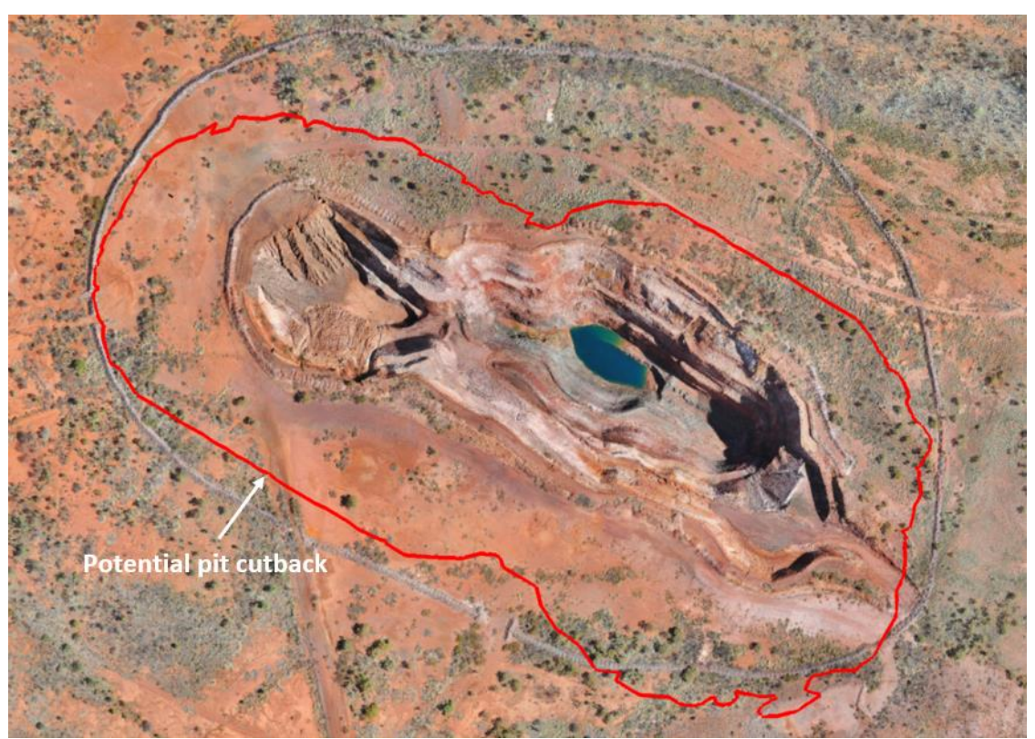
Figure: Existing Orlando Copper / Gold pit