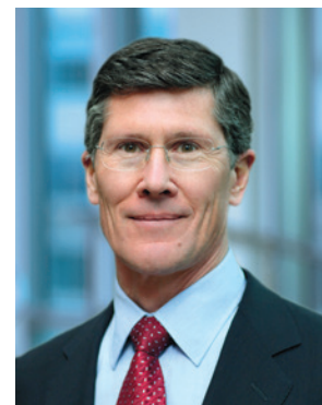
JOHN A. THAIN CHAIRMAN & CHIEF EXECUTIVE OFFICER

We recorded a pretax loss of $455 million, which reflects $1.5 billion of debt redemption charges related to the substantial progress we made eliminating our high-cost restructuring-related debt. Excluding these charges, all four commercial segments were profitable in 2012, and each continues to maintain a sound credit discipline. Our Corporate Finance business has generated more than $1 billion in new commitments for seven