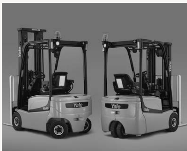
Above: Yale's next generation of electric rider lift trucks, the Yale® ERC-VG three- and four-wheel cushion tire models, have lifting capacities of up to 4,000 pounds. These trucks have been designed to increase overall productivity at higher levels of efficiency.

NACoal has a number of potential new projects and opportunities under consideration or in progress, and expects to incur additional expenses related to these opportunities in 2009. Permitting is taking place in the Otter Creek Reserve in North Dakota in expectation of construction of a new mine. Construction is continuing on coal dryers and a coal load-out facility adjacent to the Falkirk Mine, which, when complete, will improve market potential by extending practical transportation distances for shipping lignite coal. In addition, NACoal is working on a project with Mississippi Power to provide lignite coal to a new plant in Mississippi and is optimistic about concluding other new agreements in 2009.