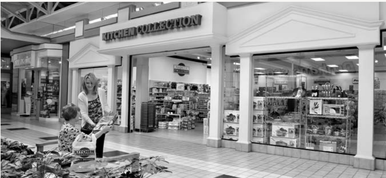
The Kitchen Collection® store in Lancaster, Ohio, features higher-margin, brand-name kitchen gadgets, small electric appliances and a variety of other kitchen- and housewares-related products.

Kitchen Collection will continue to focus on improving product mix, merchandising promotions and pricing in order to sustain the Kitchen Collection® store format and refine