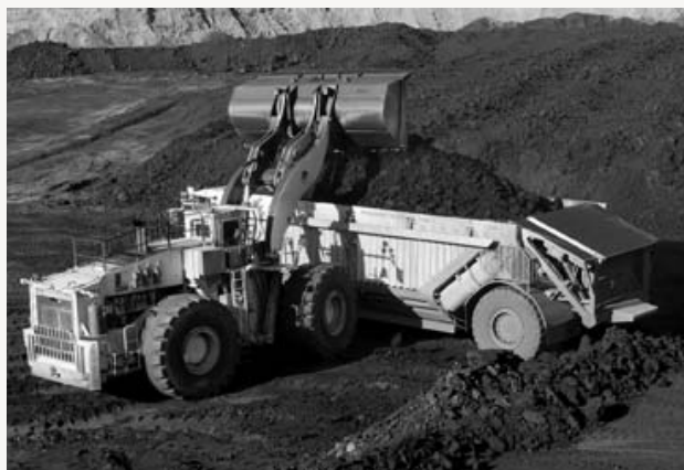
Above: A Le Tourneau front-end loader loads mined lignite coal into a Kress coal haul truck at The Coteau Properties Company's Freedom Mine in North Dakota.

We have great confidence in the management teams at each of our subsidiaries and in the many experienced and capable people working closely together around the globe to help our companies manage through the downturn. In addition, several senior NACCO parent company personnel have taken on more specific operational roles at NACCO Materials Handling Group and North American Coal, in addition to their parent company roles, to add expertise as well as to reduce costs.