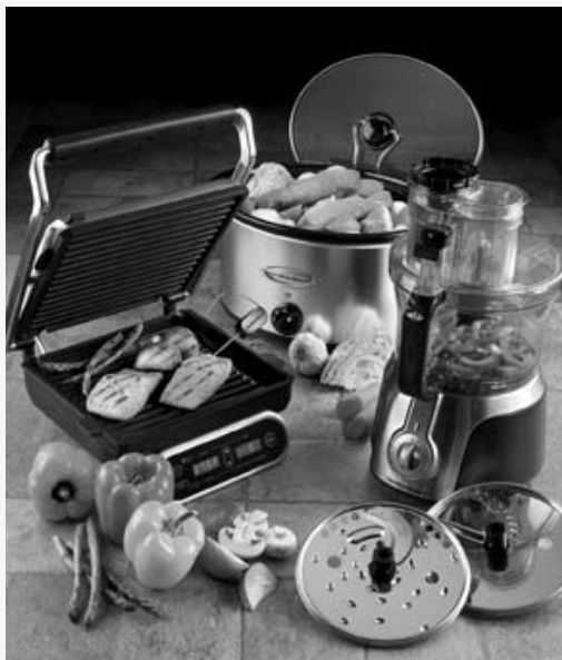
Above: Clockwise from top: Hamilton Beach Brands' newest products include: Hamilton Beach® Stay or Go™ 6 quart slow cooker with lid rest, Hamilton Beach® Big Mouth® Deluxe food processor and Hamilton Beach® Set & Forget® Grill.

At HBB, an experienced team of professionals is managing the challenges of the current economic environment aggressively. The company will continue to work to improve revenues and profitability by improving efficiencies, reducing costs and pursuing strategic growth opportunities, including those which may arise during the economic downturn. The company is well positioned to continue its leadership position in the small kitchen appliances industry and to attain its longer-term financial objectives when increased consumer spending returns.