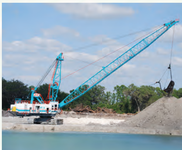
NAMining leverages our historical mining excellence and service-based business model to create value for customers by improving mining productivity and efficiencies.

10 customers at 20 quarries utilizing 30 draglines and a rope shovel as of December 31, 2019. During 2019, NAMining executed a 20-year mining services agreement to serve a new customer's cement plant in Florida. As part of this mining services agreement, NAMining is responsible for the relocation and refurbishment of a dragline. This dragline is expected to be in place and operating in the second half of 2020. In keeping with the fundamental principles that guide our other businesses, a focus on long-term customer relationships and success guides NAMining as a critical core value.