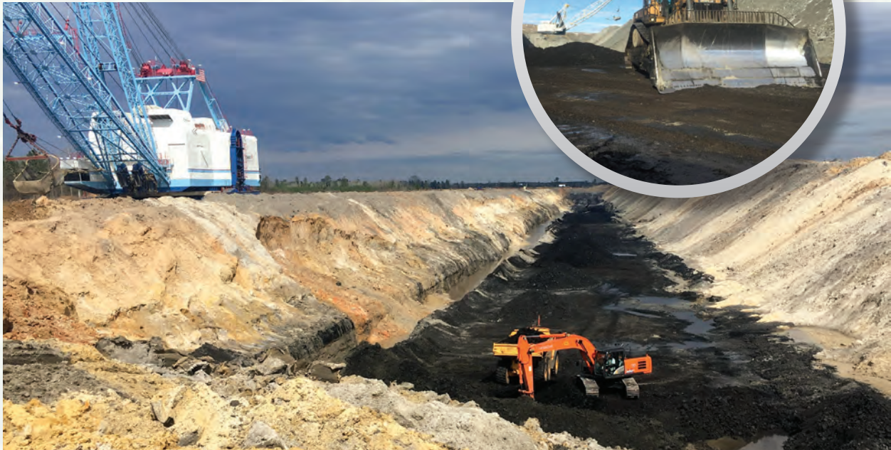
Our skilled mining experts provide comprehensive mining services, including permitting, mine planning, excavation, load and haul and reclamation. Shown are mines in Texas and North Dakota (right).

Our employees drive our success. As a service provider, we know our people are our greatest asset. We provide development opportunities for our employees, such as our supervisor-level training programs, Management Studies Program and Advanced Management Program, and we actively look for new ways to grow and develop our employees. As a result, we enjoy a strong employee retention rate and a high level of employee engagement.