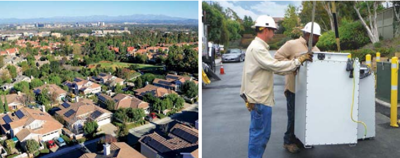
Urban and suburban neighborhoods, like this one in Irvine, Calif., are ideal places to start building the 21st Century power system.