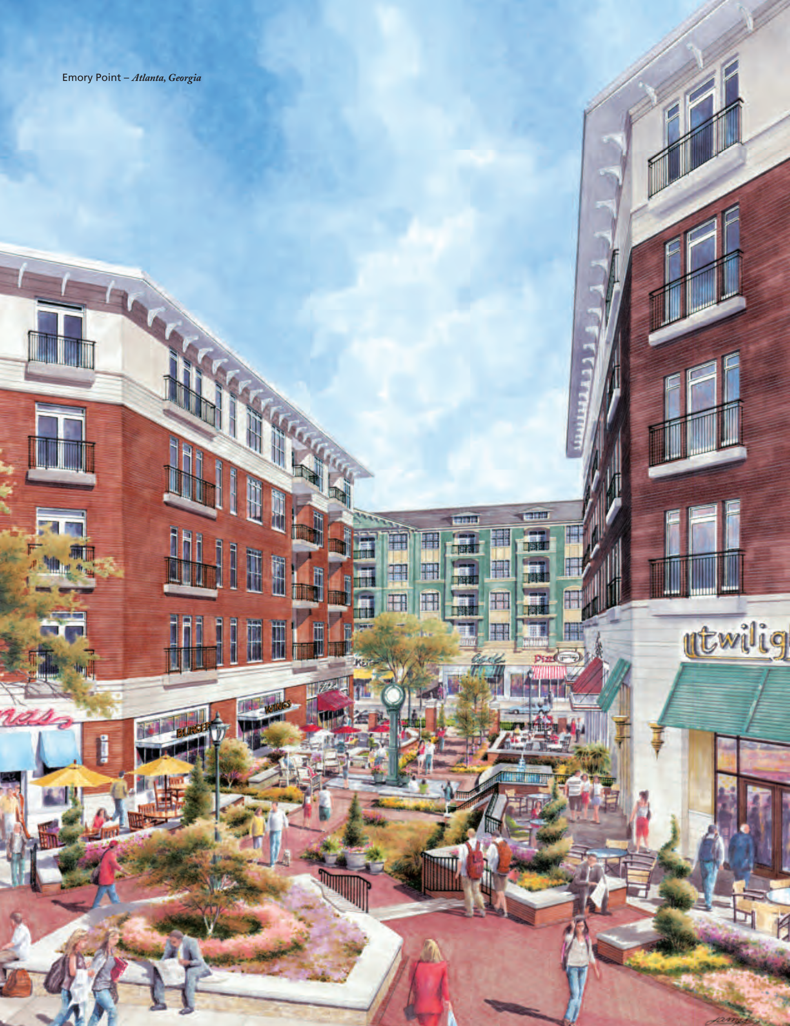
Emory Point – Atlanta, Georgia