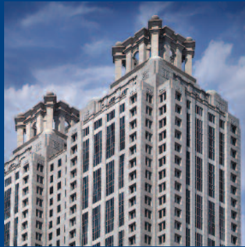
191 Peachtree ATLANTA, GA