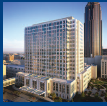
Emory Univ. Hospital Midtown ATLANTA, GA