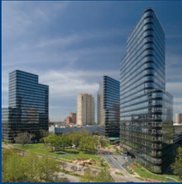
Post Oak Central HOUSTON, TX