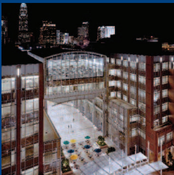
Gateway Village CHARLOTTE, NC