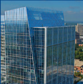
Terminus 200 ATLANTA, GA