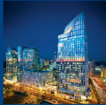
Terminus 100 ATLANTA, GA