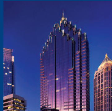
Promenade ATLANTA, GA