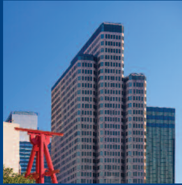
2100 Ross DALLAS, TX