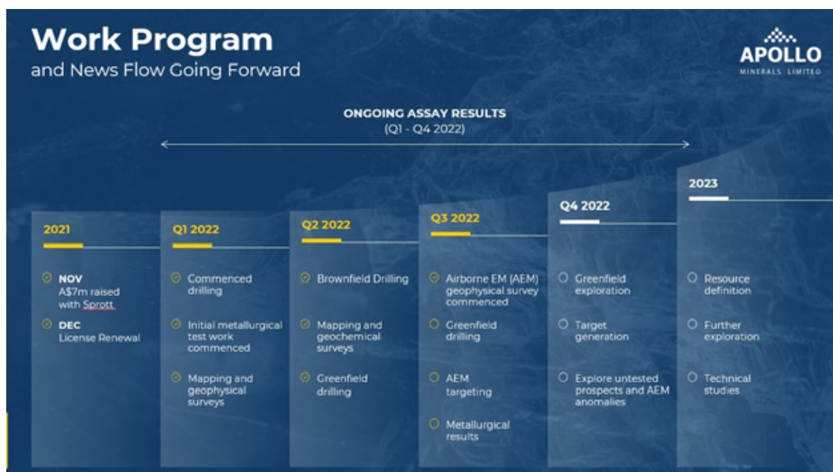
Figure 3 – Planned Exploration Program Workflow.

The Company will undertake the work program based on results as received with a strong commitment to all aspects of sustainable development and responsible mining, with an integrated approach to economic, social, environmental, health and safety management.