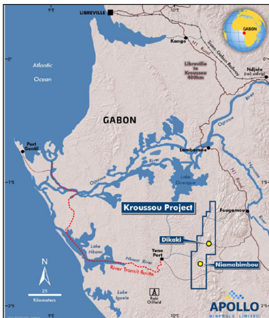
Figure 1 – Kroussou Project Location Plan.

High-level assessment of infrastructure and transport requirements for a future mining operation at Kroussou has indicated the potential for existing capability which will provide the basis for future feasibility study work.