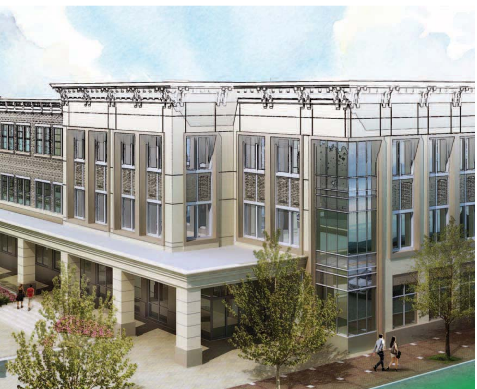
LCNB Operations Center, opening Spring 2017 downtown Lebanon, Ohio