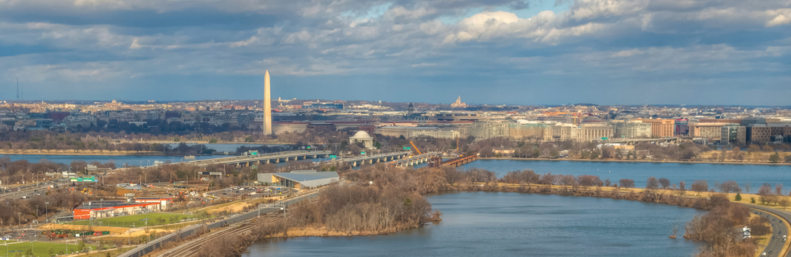
View from 1900 Crystal Drive Rooftop (under-construction multifamily asset)

The next two years are prime time for National Landing, which means they are prime time for JBG SMITH. This period will usher in the delivery of Amazon's HQ2 (2.1 million square feet), Virginia Tech's Innovation Campus headquarters, over 1,500 units of new multifamily housing, and 55 new retailers. During this time, we also expect to complete the full entitlement of our 9.7 million square foot land bank and to complete our transition to majority multifamily. While the exact trajectory of the office and debt markets is impossible to predict, we are well positioned to maximize value whatever the climate.