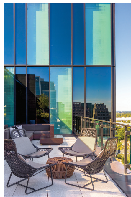
8001 Woodmont Rooftop Balcony (multifamily asset)

"Of the remaining 217,000 square feet of non-Amazon office leases expiring in 2023, approximately 90% comprises government contractors and defense tenants who likely value the proximity to the Pentagon, particularly given the high defense budget ($817 billion), and the capabilities of the digital amenities being rolled out into the neighborhood."