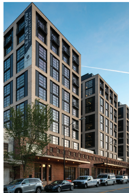
The Batley (multifamily asset)

National Landing, where almost 70% of our portfolio is located, continues to catalyze our future growth: Amazon and Virginia Tech continue to build their respective headquarters with increased emphasis on in-person work; despite a softer office market backdrop, the submarket continues to attract new tenants with its proximity to the Pentagon; and our digital infrastructure rollout, bringing next generation 5G connectivity to the area, is activating its first sites. We remain on track to deliver over 1,500 multifamily units to the submarket and, over the next 18 months, anticipate 55 new retailers to be open, revitalizing the streetscape. Alongside all of this, we continue to lead the market in ESG initiatives and set the standard by which the industry will operate. 2022 tested everyone's preparedness and agility, and we take great pride in what we were able to accomplish and how well we are positioned. We are pleased to share our achievements with you.