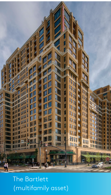
The Bartlett (multifamily asset)

“Finally, just last week Amazon mandated a return-to-office at least three days per week beginning in May, noting that collaborating, learning, and inventing are easier and more effective when employees are together and in person. We anticipate physical occupancy to continue trending upwards as Amazon and other employers recognize these realities.”