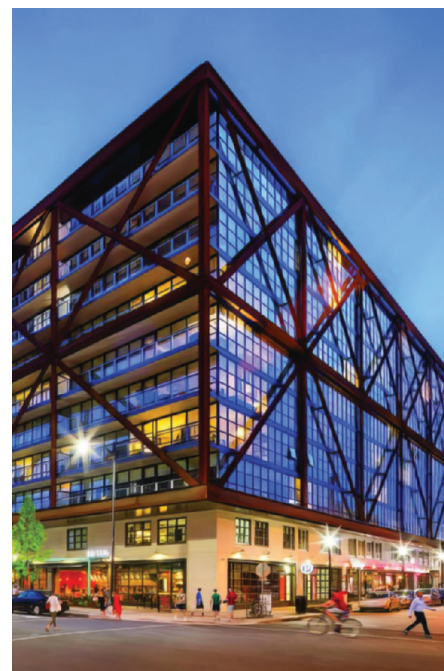
Atlantic Plumbing (multifamily asset)

We believe that advancing entitlement and design of our Development Pipeline is the best way to maximize optionality and value, either through on balance sheet development, land sales, ground lease structures, and/or recapitalizations with third parties. Our 9.7 million square-foot Development Pipeline, almost 70% of which is in National Landing, is 48% fully entitled today, with the remaining 52% in various stages of the entitlement process. We anticipate 100% of our Development Pipeline to be fully entitled by the end of 2024. Given the advancements in entitlements we have made and anticipate making in the near-to-medium term, we believe that substantially all assets in our pipeline have the potential to commence construction, or be monetized through other means as mentioned above, in the next 36 months, subject to receipt of final entitlements, completion of design, and market conditions. Accordingly, in the fourth quarter, our supplemental package disclosures were modified to breakdown our Development Pipeline by region (rather than by “Near-Term” and “Future”) and to include increased disclosure on each project. For the revised disclosures, please see our Fourth Quarter 2022 Investor Package.