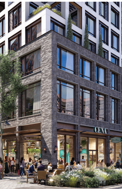
1900 Crystal Drive Street-Level Retail (rendering)

“Preserving balance sheet strength and flexibility remains paramount; as such, we expect new investments, whether development projects, acquisitions, or share repurchases, to be largely dependent on executing additional dispositions.”