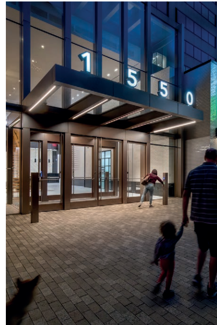
1550 Crystal Drive (commercial asset)

"Nearly 70% of CBRE's top lease transactions in Northern Virginia in the fourth quarter occurred in National Landing."