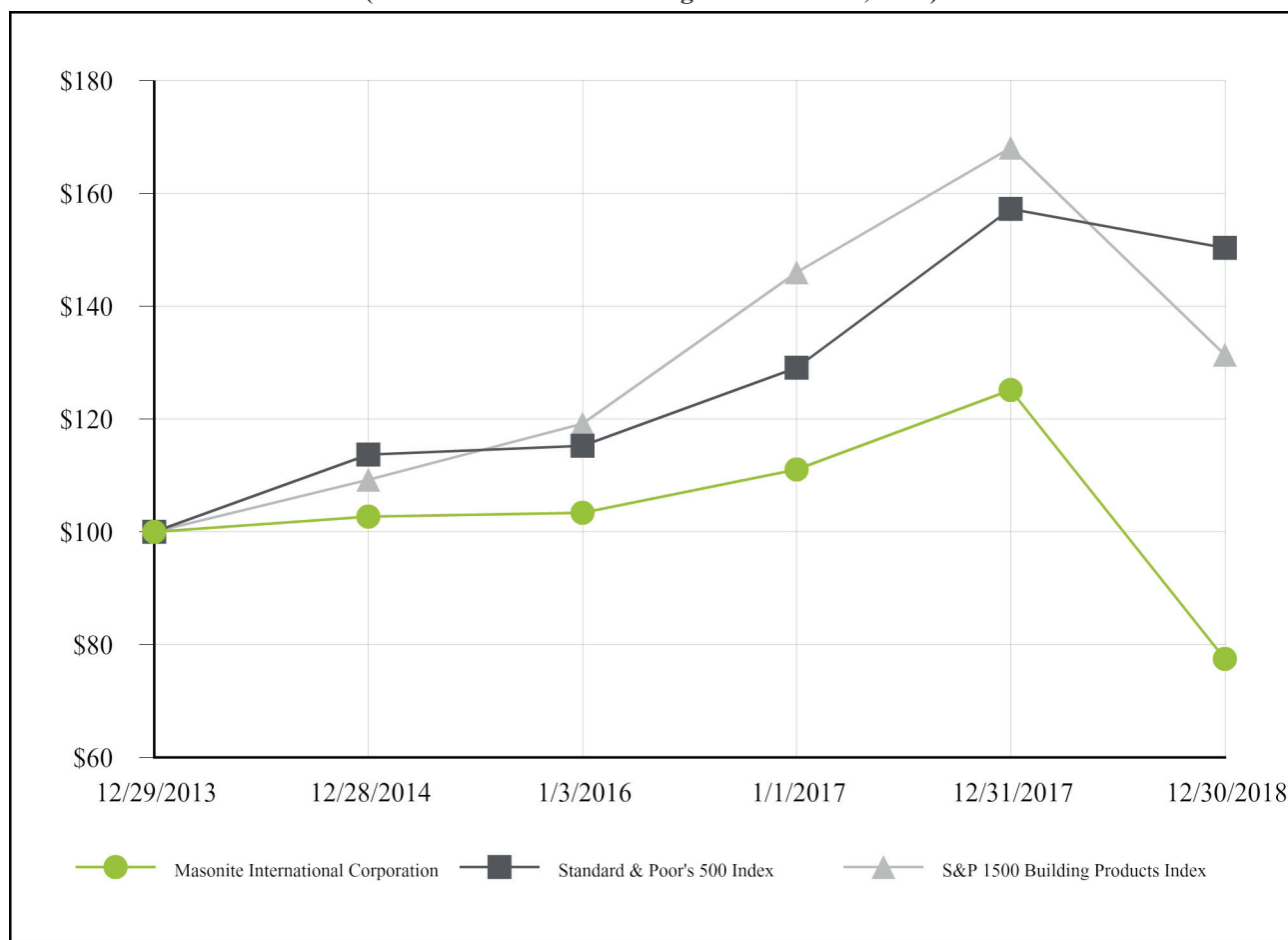
Comparison of Cumulative Total Stockholder Return Masonite International Corporation, Standard & Poor's 500 Index and Standard & Poor's 1500 Building Products Index (Performance Results through December 30, 2018)

The following graph depicts the total return to shareholders from December 29, 2013, through December 30, 2018, relative to the performance of the Standard & Poor's 500 Index and the Standard & Poor's 1500 Building Products Index. The graph assumes an investment of $100 in our common stock and each index on December 29, 2013, and the reinvestment of dividends paid since that date. The stock performance shown in the graph is not necessarily indicative of future price performance.