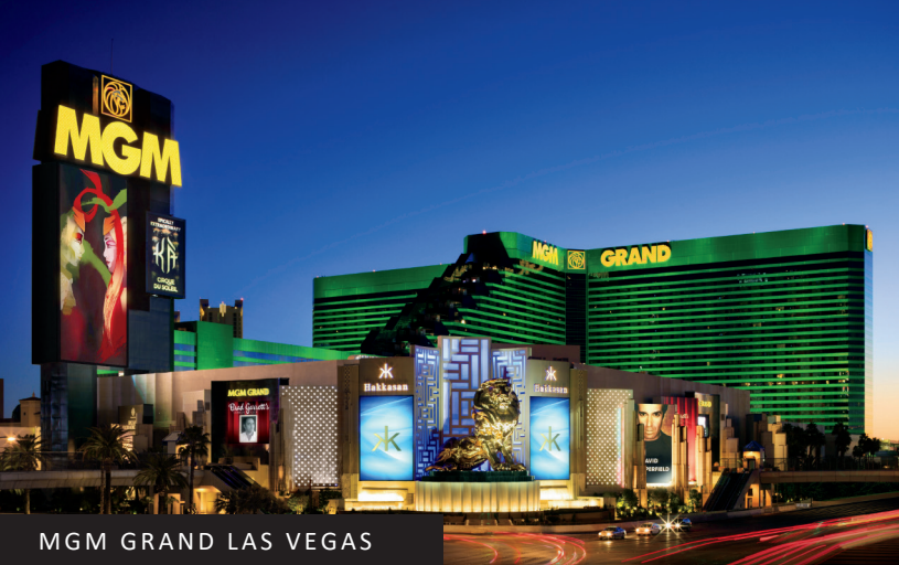
MGM GRAND LAS VEGAS