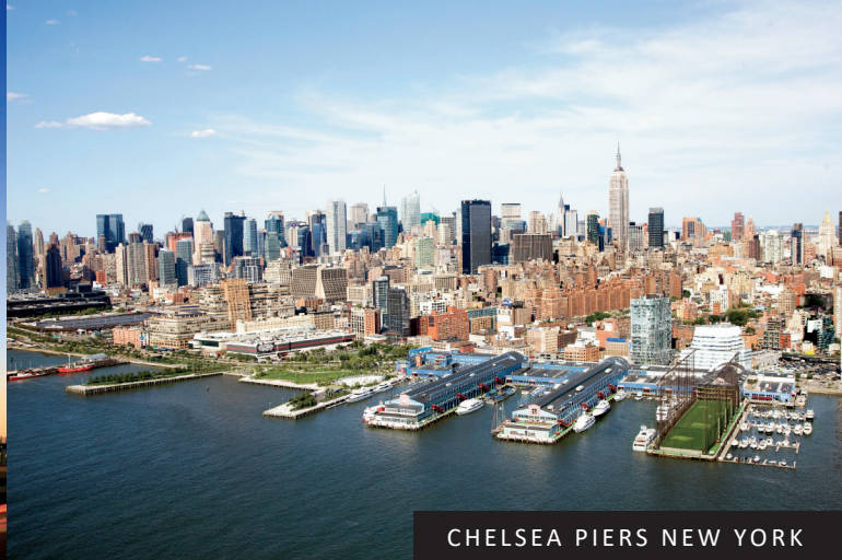
CHELSEA PIERS NEW YORK