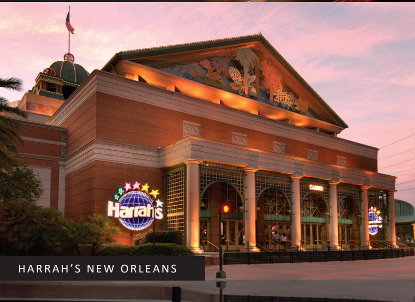
HARRAH'S NEW ORLEANS