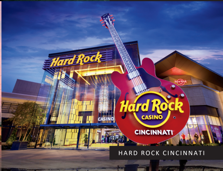
HARD ROCK CINCINNATI