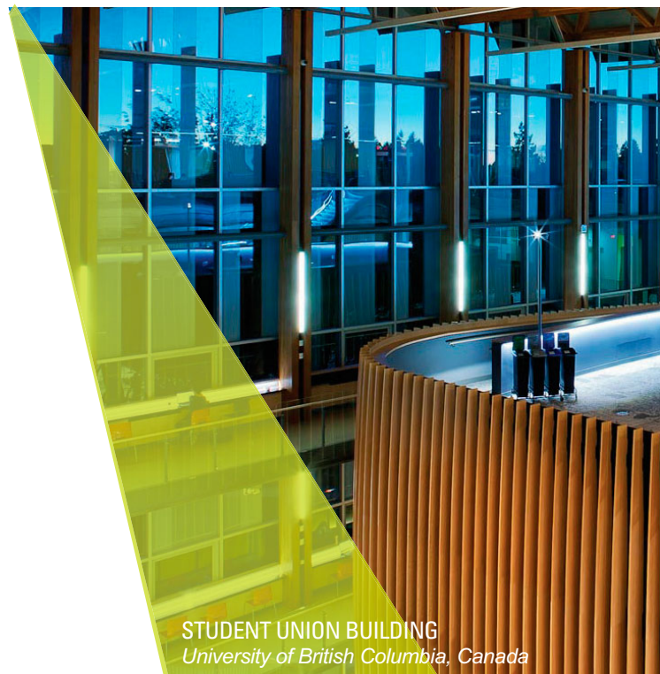
STUDENT UNION BUILDING University of British Columbia, Canada

2016 was defined by increased momentum in large project opportunities as well as engineer-procure-construct (EPC) work. In September, we were awarded a project with Cross Texas Transmission, an affiliate of LS Power, to procure and construct the new Limestone to Gibbons Creek transmission line. This project consists of approximately 68 miles of 345kV transmission in southeast Texas and is part of the 345kV Houston Import Project. Construction is under way with scheduled completion in the spring of 2018. We are one of just a few contractors with the resources and expertise required to complete challenging electrical infrastructure projects of this size. This project will enhance our portfolio and position us well for the future execution of similar work.