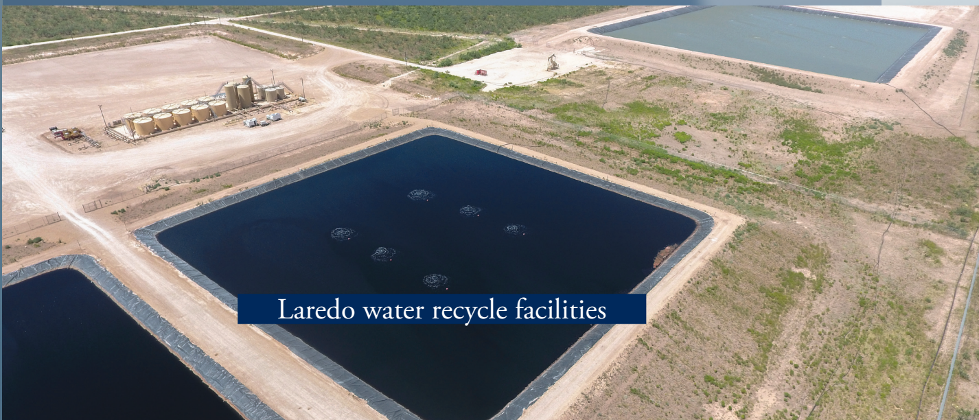
Laredo water recycle facilities

Our activities are primarily focused on the multi-target stacked horizontal development of our Permian Basin acreage position located in West Texas. These plays are characterized by high oil and liquids-rich natural gas content, multiple target horizons, extensive production histories, long-lived reserves, high drilling success rates and significant resource potential.