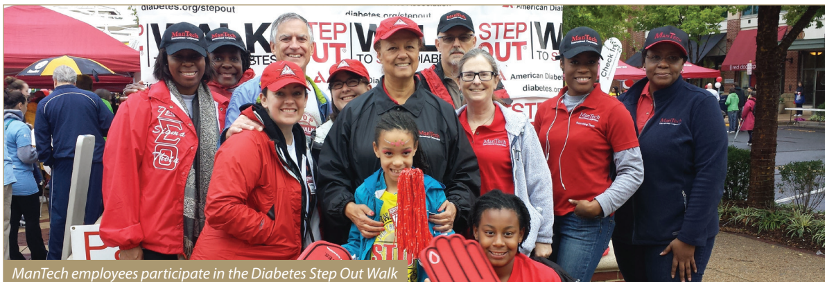
ManTech employees participate in the Diabetes Step Out Walk