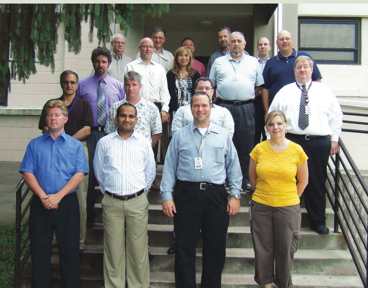
ManTech's Joint Medical Logistics Functional Development Center Team at Ft. Detrick

Through the years of our nation's existence, military medical care has grown from a president's firm reminder of a nation's obligation to a complex system for active-duty military, retirees, their families, and veterans. Studies show that a significant percent of hospital expenses are invested in logistical necessities like storage, laundry, cleaning, etc., and that almost half the cost associated with supply chain processes could be eliminated by improving practices. ManTech's experts are working to make this happen at one critical DoD program - the Joint Medical Logistics Functional Development Center (JMLFDC) with staff working from Ft. Detrick, Maryland, and Herndon, Virginia. ManTech manages hundreds of operations and ensures full operability through specialized support teams of systems, database, and network engineers who monitor each of the production sites and respond to product functionality issues reported by the end users. The JMLFDC was established to improve productivity and efficiency, provide better care and patient experience, decrease costs and manual tasks, and ensure patient safety. ManTech is doing its part to support that mission with technology solutions that support the sacrifice of our brave service members who rely on these facilities every day.