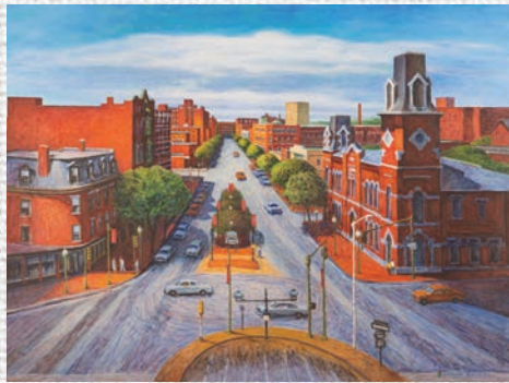
Rialto On Upper Central Street, Vassilios (Bill) Giavis