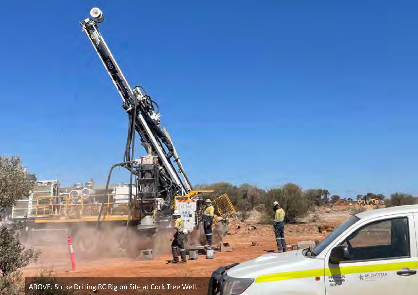
ABOVE: Strike Drilling RC Rig on Site at Cork Tree Well.