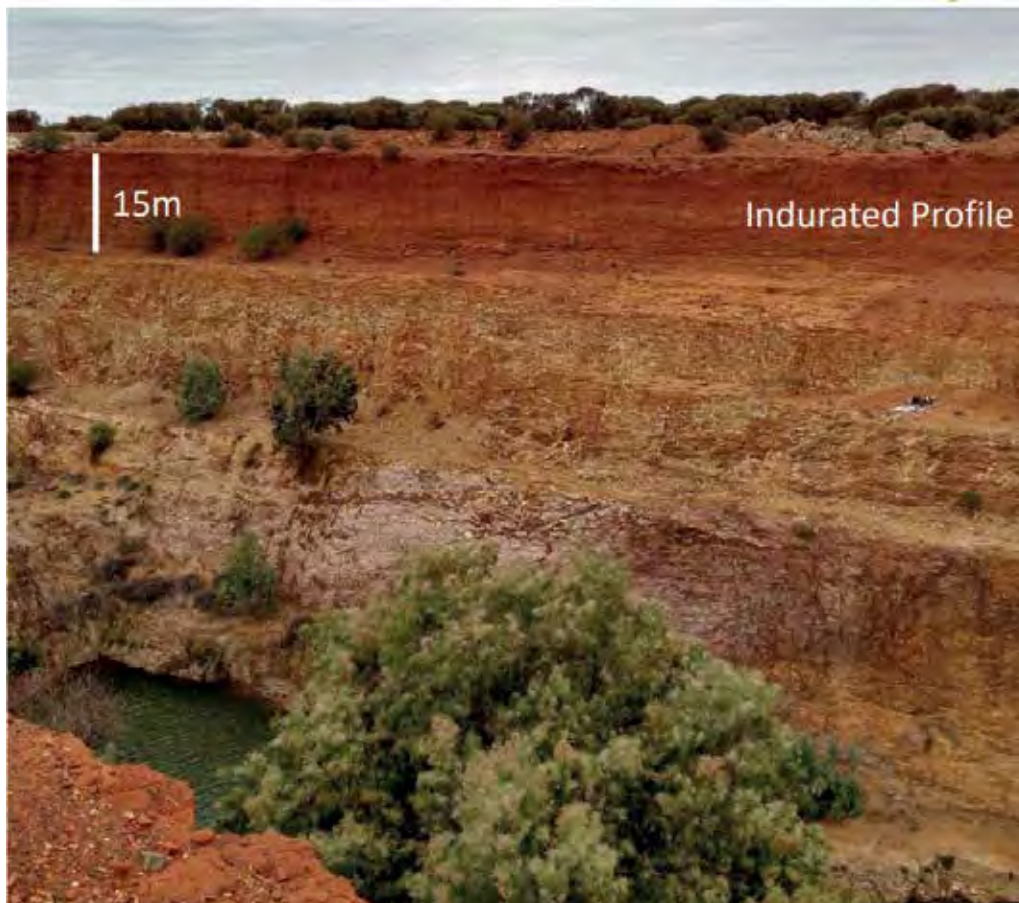
Figure 1: Indurated near surface hardpan and pallid zone below.

48 samples were collected from the top 10cm of the soil profile on E38/2452. Approximately 1kg of material was sieved to -2mm to remove coarse lag. Sample spacing was at 100m x 200m. Samples were analysed by Minanalytical Perth using an Aqua Regia digest and ICP-MS/ICP-OES finish for a 47 element Suite. ICP-MS and ICP-OES. The nearby Cork Tree Well open cut pit shows a well-developed, +10m, indurated profile (See Figure 1). This is common throughout the Laverton area but is not seen commonly further south. This profile is probably the reason for the poor response from soil sampling away from outcrop/sub crop in the Laverton region.