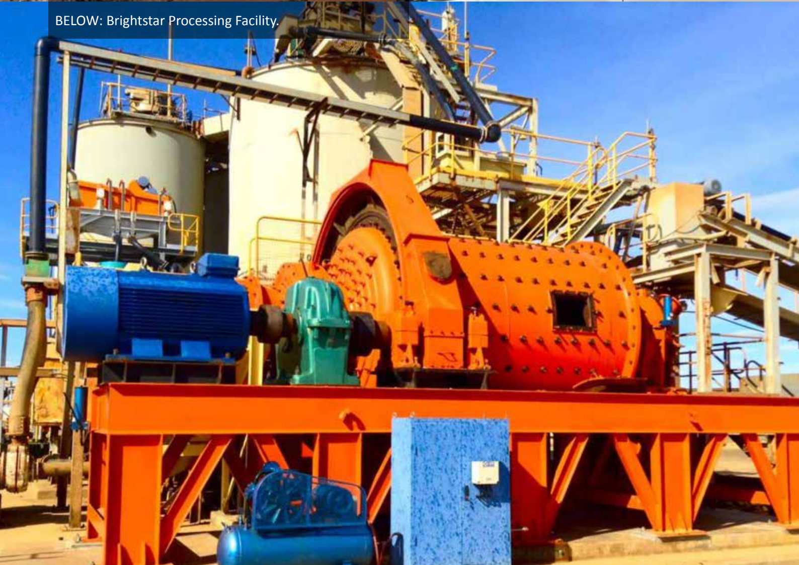
BELOW: Brightstar Processing Facility.