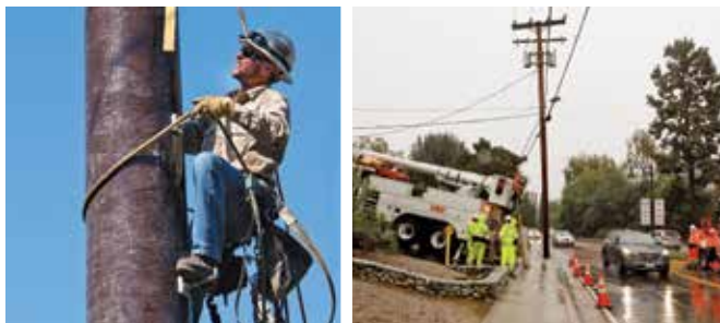
Photos, from left to right: 1 Covered conductors are being installed in high fire risk areas 2, 3 Installing weather stations and cameras is part of SCE’s Wildfire Mitigation Plan 4 SCE is replacing wood poles in some areas with composite poles 5 SCE crews work to safely restore power.

We are in our current situation due to what we believe is a breakdown of the regulatory compact in our state. In the application of a principle largely unique to California, courts have held investor-owned utilities strictly liable for wildfire damages where utility infrastructure is a substantial cause of the wildfire, even if the utility is not at fault. This is based on a legal theory called “inverse condemnation,” whereby courts have concluded that the utility has taken (or “condemned”)