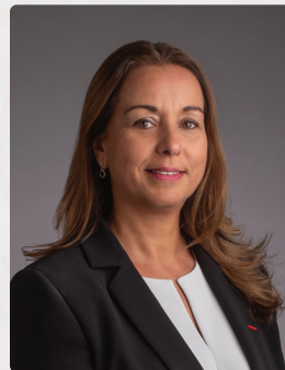
Ilham Kadri, PhD