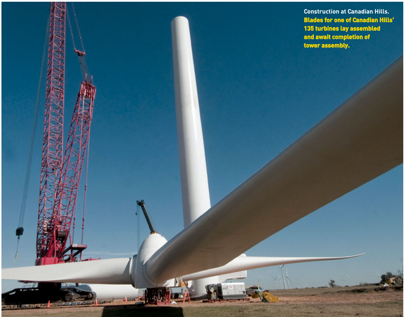
Construction at Canadian Hills. Blades for one of Canadian Hills’ 135 turbines lay assembled and await completion of tower assembly.

We also continued to grow through acquisitions. In December, we acquired Ridgeline Energy, a Seattle-based wind and solar project developer, for $81 million. The acquisition added 150 MW of net operating capacity to our portfolio, including 100% of Meadow Creek, a 120 MW wind project in Idaho, which Ridgeline successfully managed through financing and construction to completion in December. Two other operating wind projects formed part of this acquisition—a 20% interest in the 80 MW Rockland project, which increased our ownership interest to 50% with an operating role, and a 12.5% interest in the 125 MW Goshen North project. Ridgeline has demonstrated capabilities in developing, financing, constructing, operating, and acquiring renewable energy projects, and it has brought to Atlantic Power a pipeline of wind and solar projects under development in the United States and Puerto Rico.