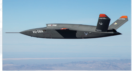
Unmanned Aerial Systems