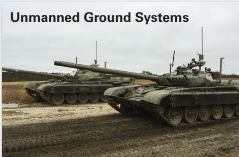
Unmanned Ground Systems