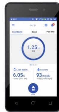
Omnipod DASH PDM

The Omnipod System is a discreet two-part design, the Pod and the PDM, that eliminates the need for the external tubing required with conventional pumps.