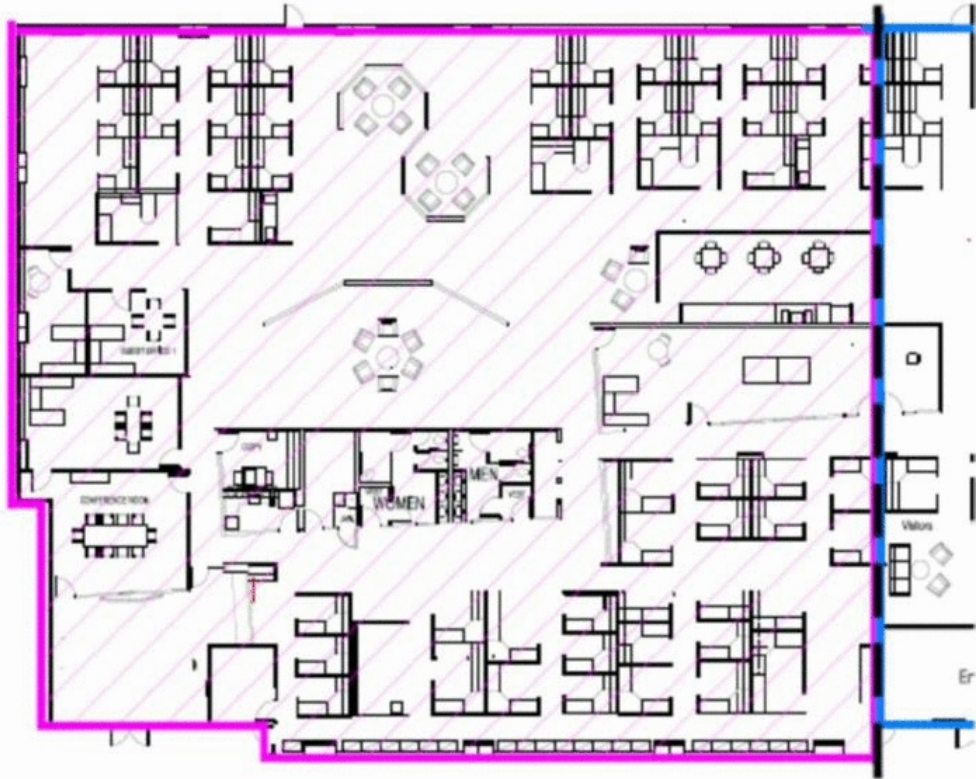
EXHIBIT A BRITANNIA POINT EDEN OUTLINE OF PREMISES