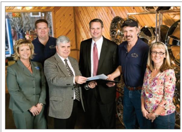
Poor Boys, Inc. with Point Pleasant, West Virginia Market Team Members