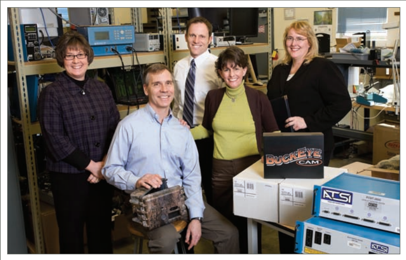
ATSI with Athens, Ohio Market Team Members