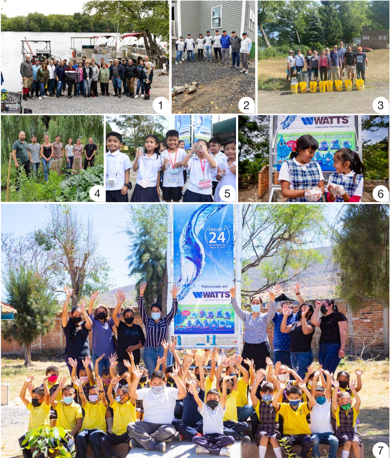
1) North Andover employees pulled trash from the Merrimack River in Methuen, MA, U.S. 2) Members of the Finance Team participated in a Habitat for Humanity build. 3) North Andover employees pulled trash from banks of the Merrimack River in Groveland, MA, U.S. 4) Employees in Moirans, France created a community garden at the site. 5) Students in the Philippines enjoyed clean water from the AquaTower provided by Watts through its partnership with Planet Water Foundation. 6 & 7) Students in two communities in Mexico celebrated their new handwashing stations provided by Watts as part of its partnership with Planet Water Foundation.