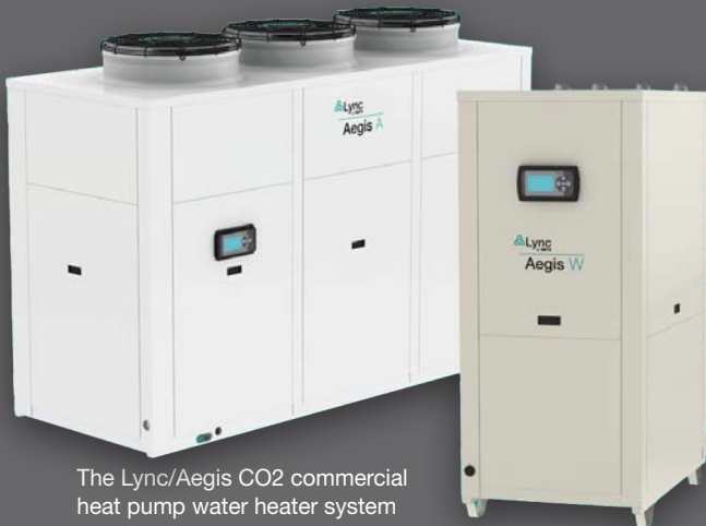
The Lync/Aegis CO2 commercial heat pump water heater system

Through our smart and connected strategy, Watts delivers superior customer value with innovative products and solutions that provide more efficient ways to select, procure, install, and maintain systems. These offerings helped fuel our organic sales growth and comprised 19% of 2022 sales. Our goal is to generate 25% of revenue from smart and connected enabled products by year-end 2023.