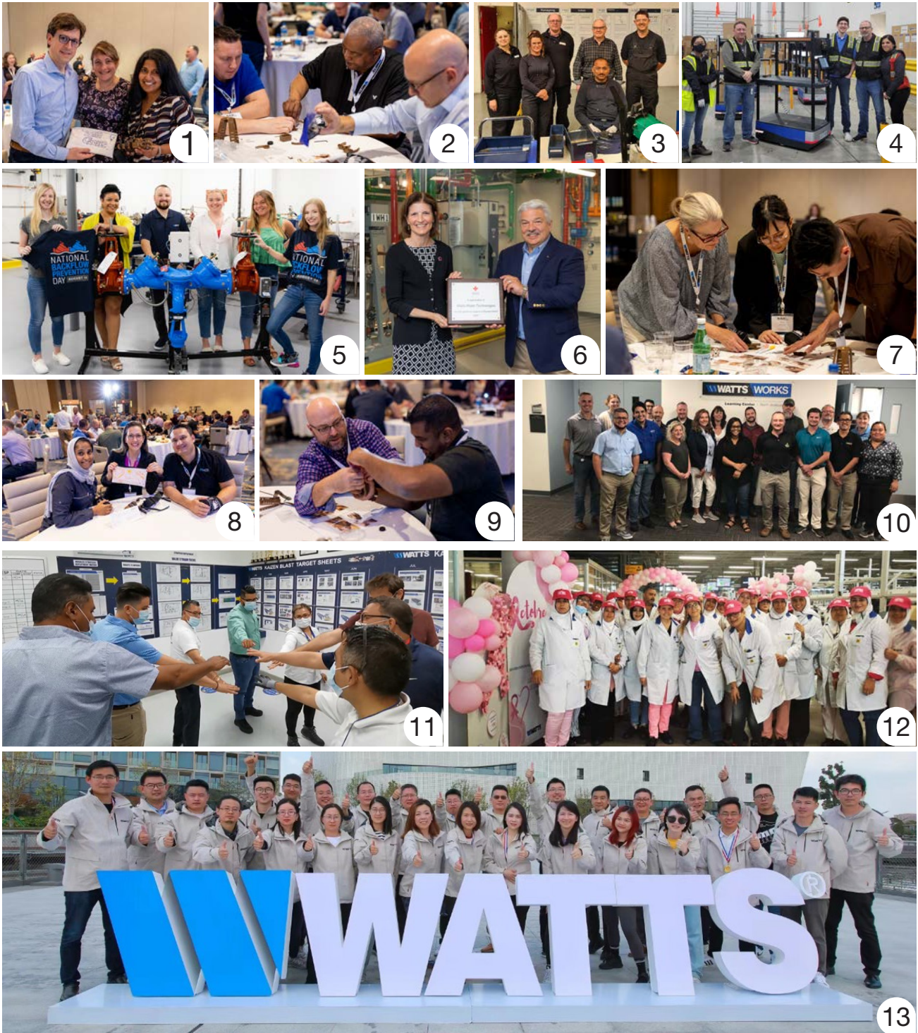
1 & 2) Watts leaders participated in a team-building session to assemble prosthetic hands for those in need. 3) The Vildbjerg, Denmark team get recognized for a continuous improvement project. 4) The team in Groveport, Ohio, U.S. posed with a new order fulfillment robot named "Chuck." 5) The Marketing Communications Team prepared to celebrate the second annual National Backflow Prevention Day. 6) The American Red Cross presented Watts with a plaque for the company's disaster relief efforts. 7, 8, & 9) Watts leaders participated in a team-building session to assemble prosthetic hands for those in need. 10) A cross-functional team participated in Lean Six Sigma Green Belt Training. 11) A cross-functional team of leaders in Franklin, NH, U.S. and Nogales, Mexico completed the sites' One Watts Performance System Business Assessment. 12) Employees in Monastir, Tunisia celebrated Watts global Pink for a Day event which raised $25,000 for Breast Cancer research. 13) The China Sales Team gathered in Shanghai for their annual meeting.