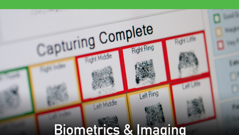
Biometrics & Imaging