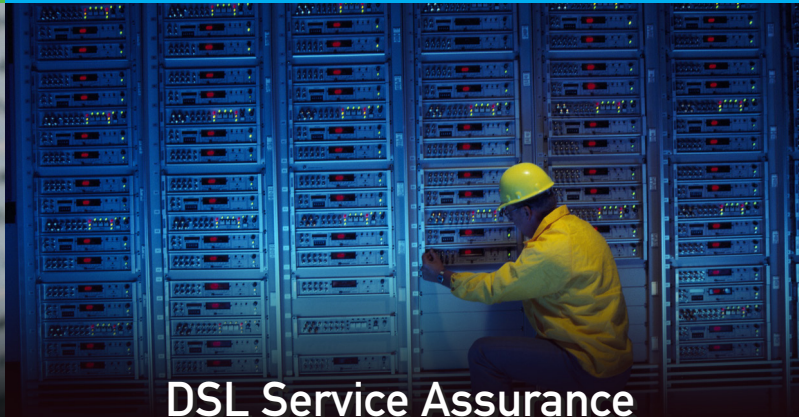
DSL Service Assurance