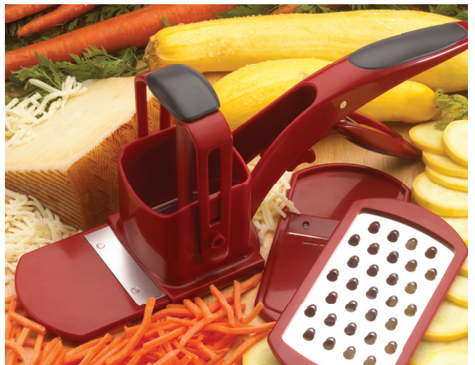
Speed Prep, the One Handed Mandoline Slicer