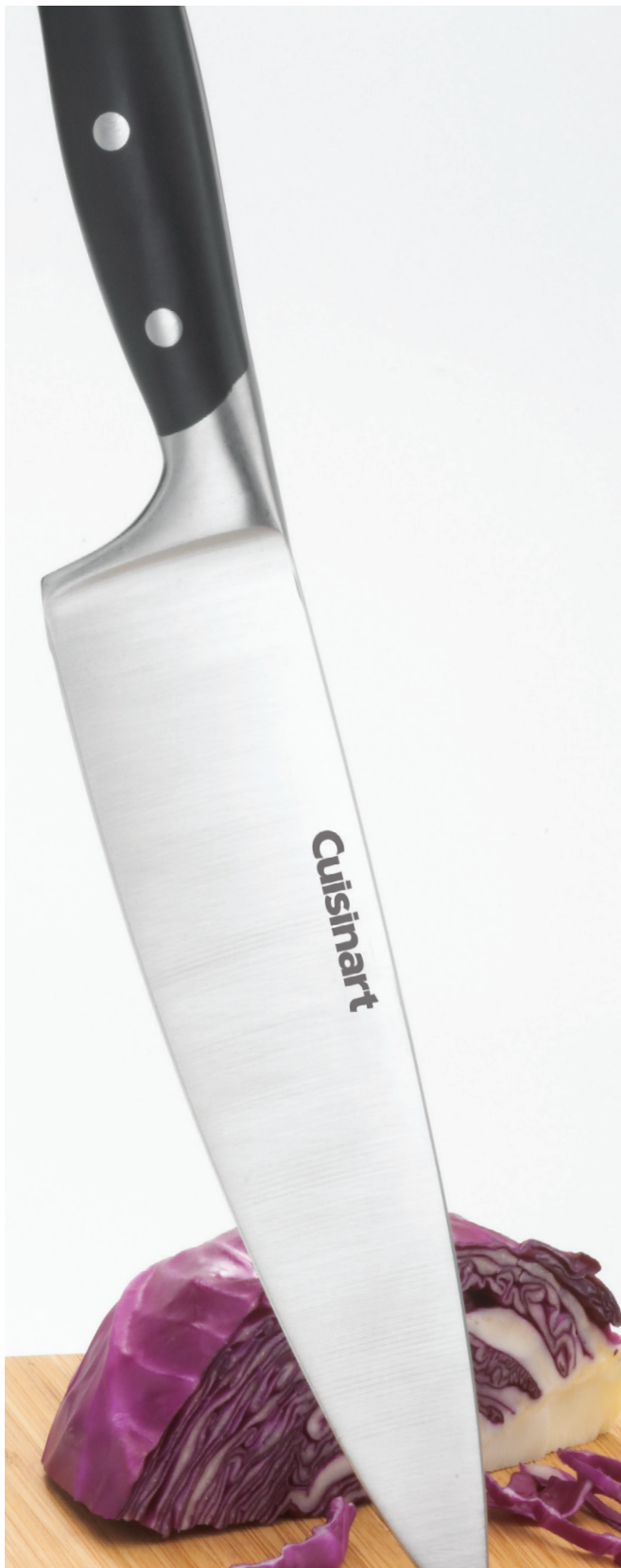
Cuisinart® CA-X Series Chef Knife