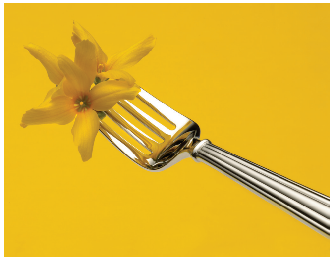
Mikasa® Italian Countryside