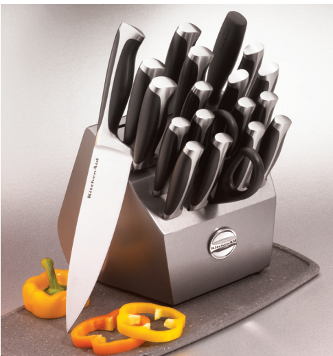
KitchenAid® 20 Piece Side-Tang Cutlery Set