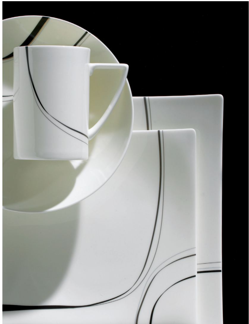
Mikasa® Modernist Place Setting