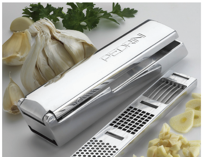
Pedrini® 3-in-1 Garlic Press