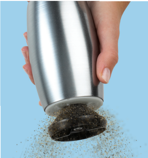
Kamenstein® 360° Pepper Grinder

Lifetime Brands, Inc. is North America's leading designer, developer and marketer of a broad range of nationally branded consumer products used in the home, in such categories as Kitchenware, Cutlery & Cutting Boards, Bakeware & Cookware, Pantryware & Spices, Dinnerware, Flatware, Glassware, Home Décor, Picture Frames and Bath Accessories.