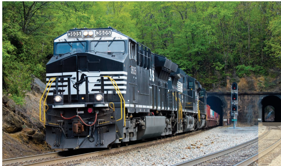
(Top) An intermodal train operates at the South Carolina Inland Port in Greer, S.C. Norfolk Southern helps customers reduce transportation costs and supply-chain carbon emissions by offering truck-competitive service over rail between the inland port and the Port of Charleston.