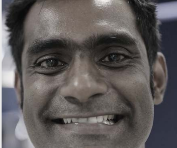
TREAT OUR EMPLOYEES