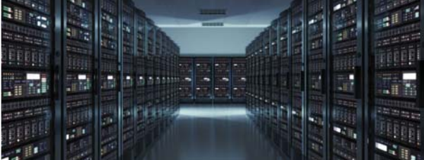
COMPUTING & STORAGE