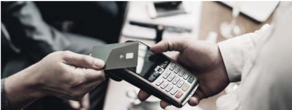
PRINT & RETAIL