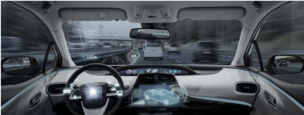
AUTOMOTIVE & TRANSPORTATION