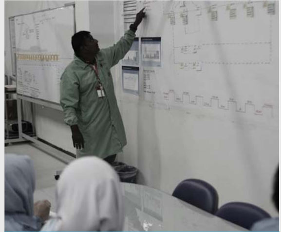
EXTEND CREATIVE SOLUTIONS TO OUR CUSTOMERS