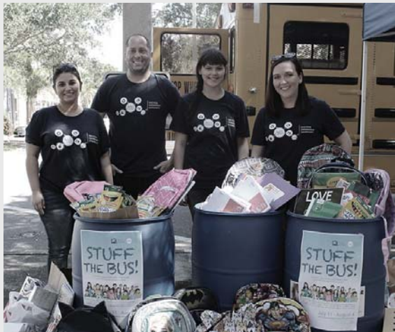
GIVE BACK TO OUR LOCAL COMMUNITIES