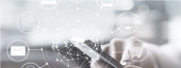
CONNECTED CONSUMER TECH