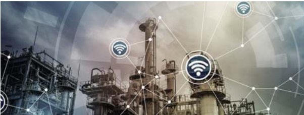
ENERGY & INDUSTRIAL