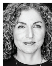
ANOUSHEH ANSARI Director since 2016 Age 54