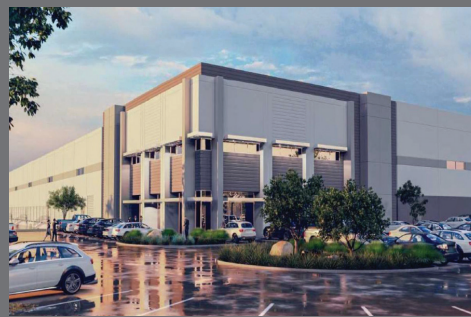
Wilmer Industrial - Wilmer, TX