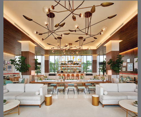
The Dalmar and Element - Fort Lauderdale, FL