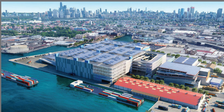
Sunset Industrial Park - Brooklyn, NY