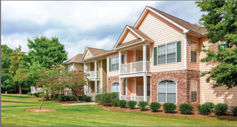
Village at Almand Creek - Conyers, GA