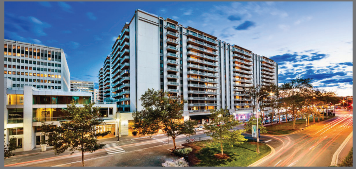
The Buchanan - Arlington, VA