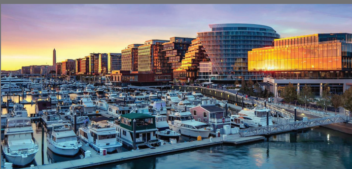
The Wharf - Washington, DC