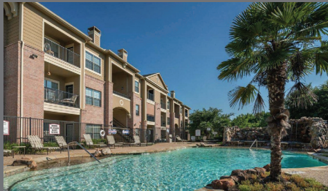
Mission Eagle Pointe - Allen, TX