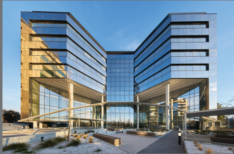
Costa Brava - Madrid, Spain