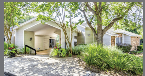
Landmark at Pine Court - Columbia, SC