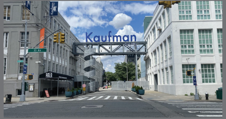
Kaufman Astoria Studios - Astoria, NY