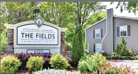
Fields at Peachtree Corners - Norcross, GA