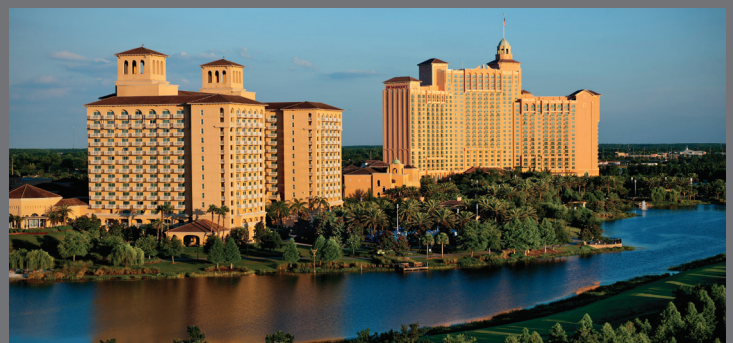
Grande Lakes Orlando - Orlando, FL