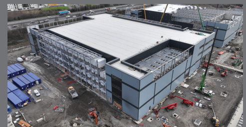
Echelon Data Centres - Clondalkin, Ireland