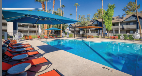
The Julia - Mesa, AZ