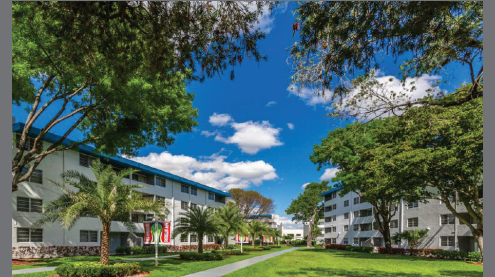
Art 88 - Miami, FL