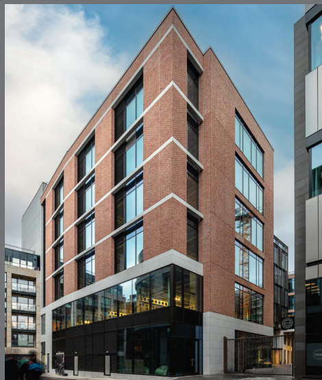
One Le Pole Square - Dublin, Ireland