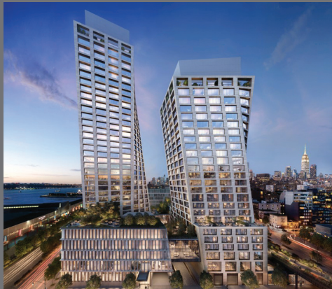
One High Line - New York, NY