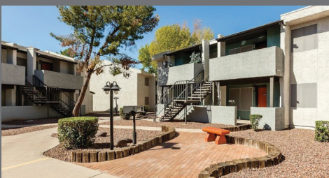
Portola North Phoenix - Phoenix, AZ