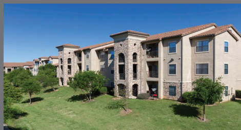
Costa Bella - San Antonio, TX