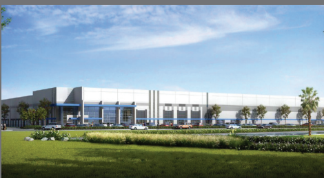
Sherwin Williams - Statesville, NC