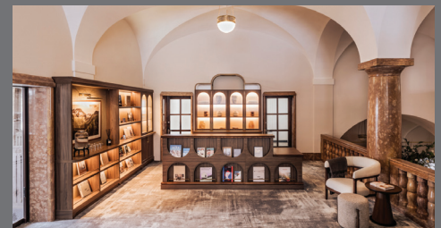
Arenas - Arosa, Switzerland