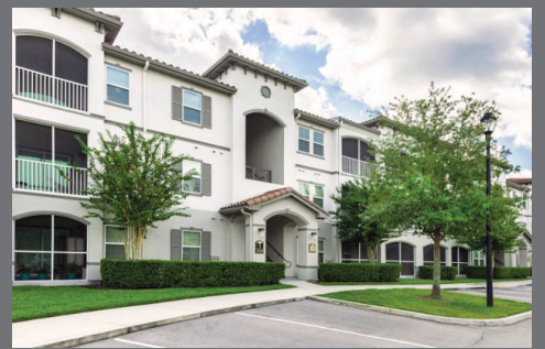
Casa Mirella - Windermere, FL