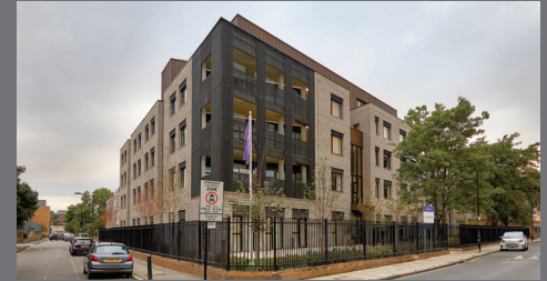
Country Court Care Homes - London, U.K.