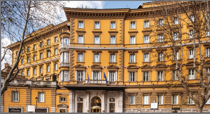
Baccarat Hotel Rome - Rome, Italy