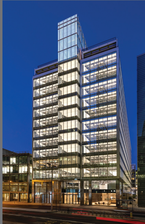
280 Bishopgate - London, U.K.