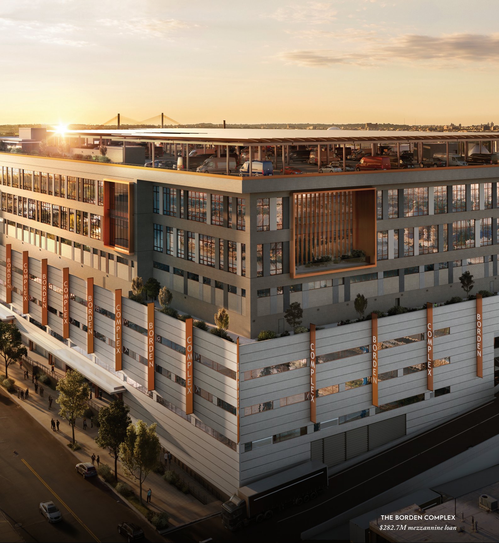
THE BORDEN COMPLEX $282.7M mezzanine loan