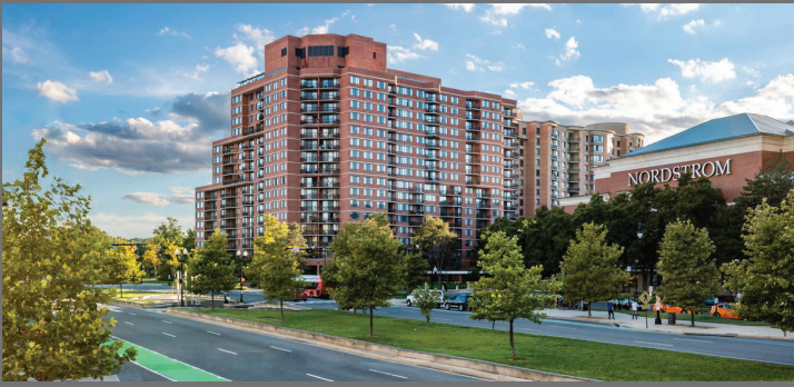
Park at Pentagon Row - Arlington, VA