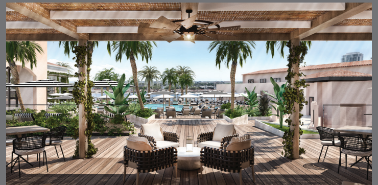
The Vinoy® Renaissance St. Petersburg Resort & Golf Club - St. Petersburg, FL