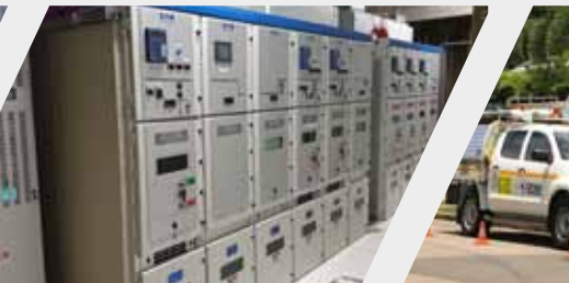
RU DATA CENTRE