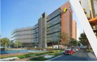
AUSTRALIA TECHNOLOGY PARK BUILDING 1