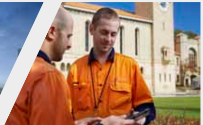
THE UNIVERSITY OF WESTERN AUSTRALIA