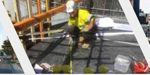
32 SMITH STREET