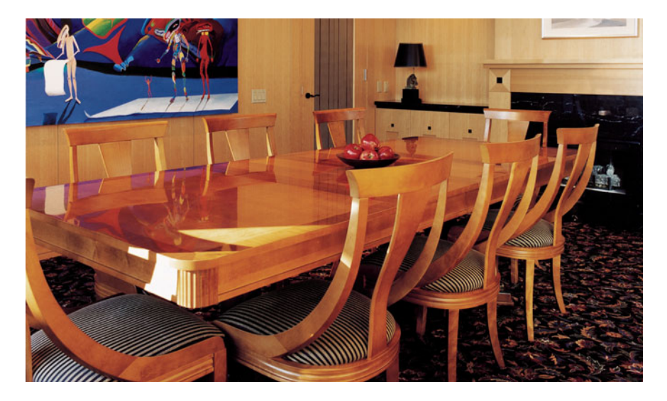
Custom furnishings and millwork

Enjoying steady demand and stable pricing, the hardwood industry is ideally suited to the income trust structure.