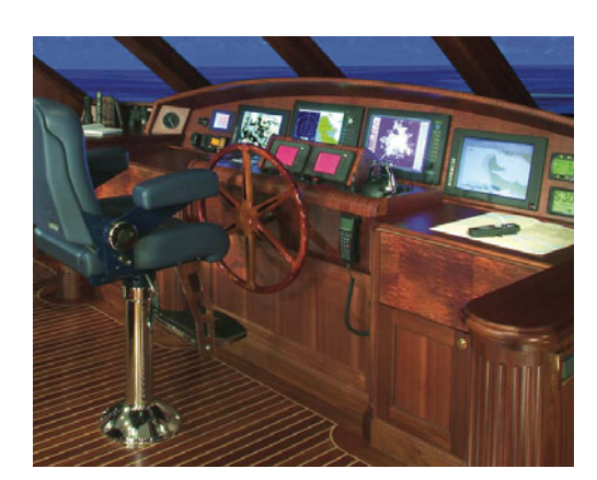
Exotic woods for luxury yacht interiors