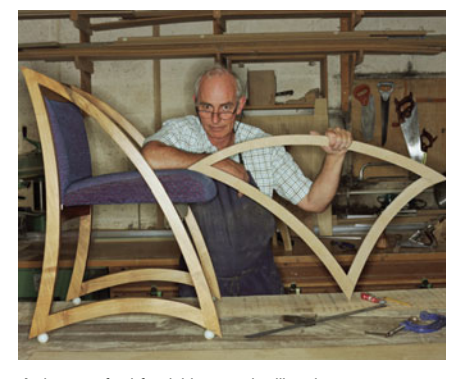
Artisan crafted furnishings and millwork