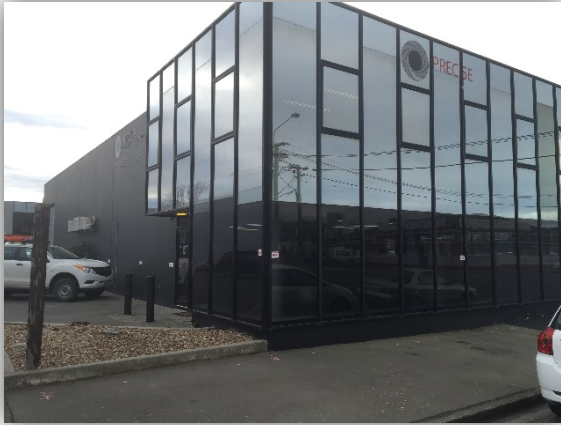
Figure 5 - Precise new Christchurch Facilities