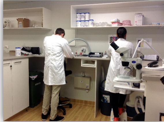
Figure 4 - OCTIEF Laboratory Staff

Key clients of OCTIEF include government agencies, education institutions and major utilities.