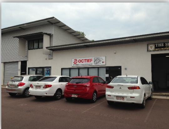
Figure 7 - OCTIEF Darwin Facility

During the year, the Group opened new laboratories in Darwin (November 2014) and Wellington (April 2015). HRL now has the ability to provide its full range of services to the Northern Territory and Wellington markets, providing a new geographic source of organic growth to the Company going forward.