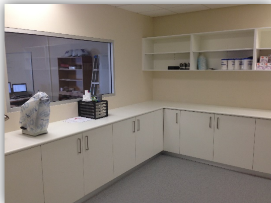
Figure 8 - Darwin Laboratory