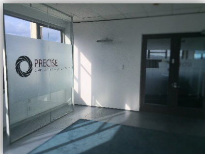
Figure 9 - Precise Wellington Office