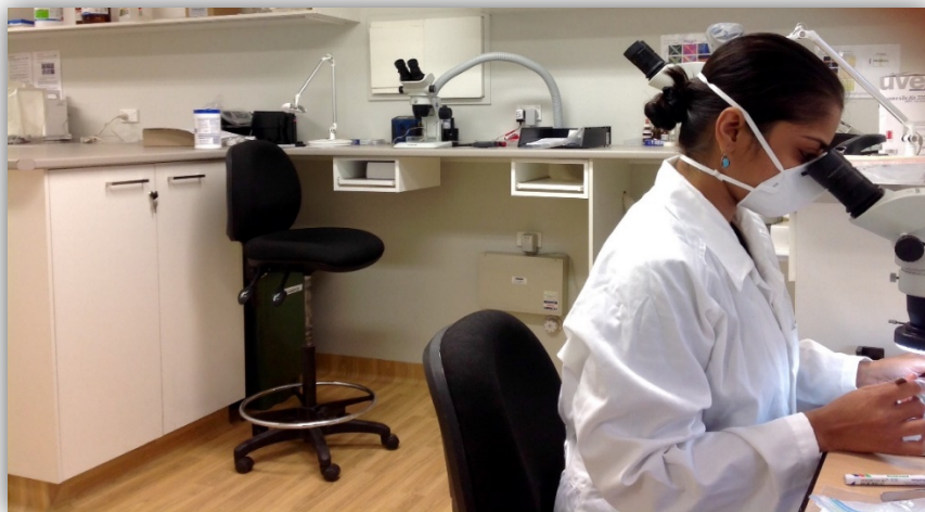
Figure 1 - Asbestos Testing in the Brisbane Laboratory