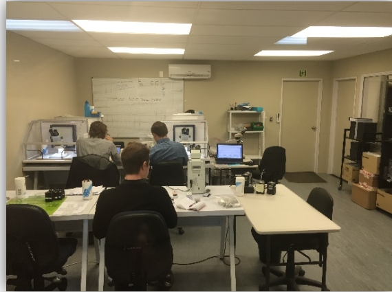
Figure 6 - Precise laboratory staff

Key clients of Precise include government agencies, construction firms and major telecommunications companies.