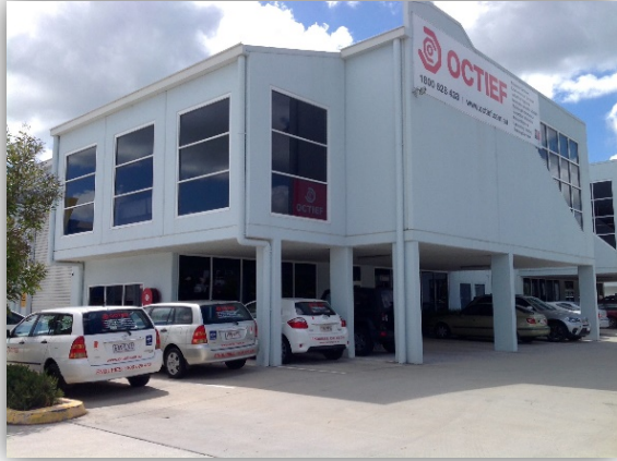
Figure 3 - Brisbane Facility

OCTIEF provides services including asbestos and hazardous materials management, industrial hygiene, building and contaminated land assessment, specialised laboratory analysis and on-site testing and monitoring.