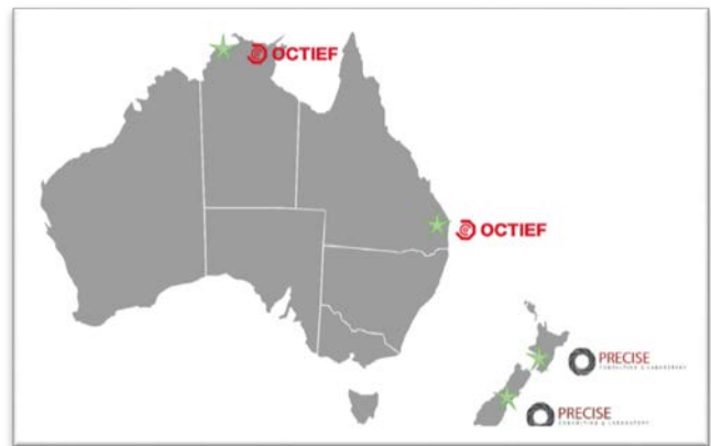
Figure 2 – HRL Group Laboratory Locations

Geothermal exploration projects have been placed on care and maintenance while the Company evaluates the best way to develop the projects held.