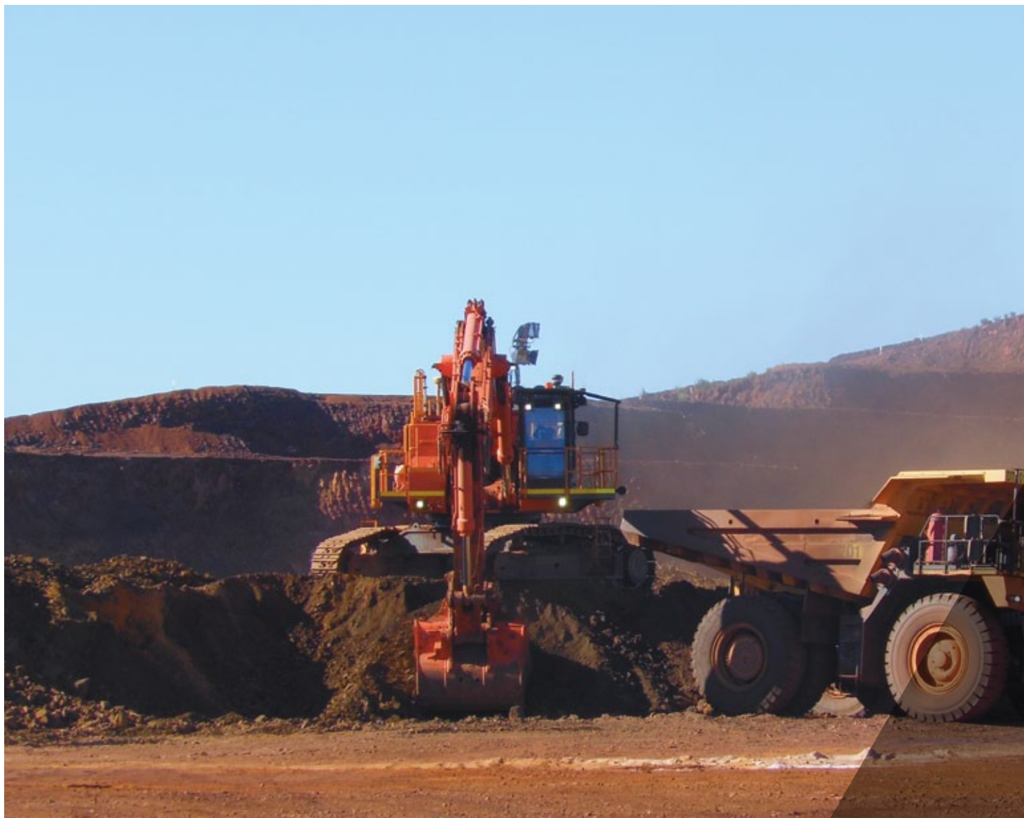
Extension Hill open pit

The main T6 pit was completed in March while mining in the T1 satellite pit concluded in the June quarter, taking total life of mine ore production at Tallering Peak to 25 million tonnes.