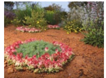
Native flora, Extension Hill