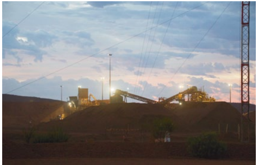
Extension Hill processing

Mount Gibson will now focus on the safe implementation of the approved Mine Closure Plan with removal of site infrastructure already underway. Closure is scheduled to occur in late September however rehabilitation works will continue over the next 6-12 months.