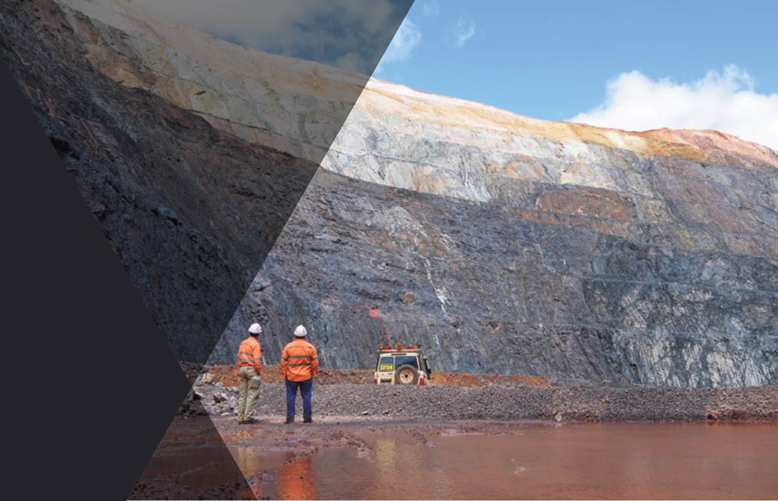
Talling Peak Main Pit