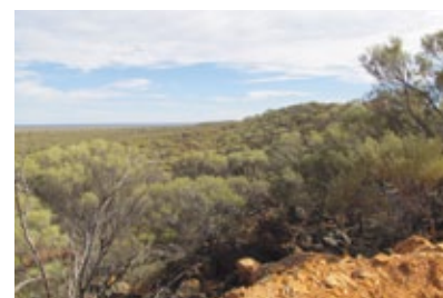
Shine hematite project

The review supported a target DSO production rate of approximately 1.6 million tonnes per annum, with an indicative capital development cost of $9-11 million and total life of mine average cash operating costs of approximately $75 per tonne of ore sold FOB.