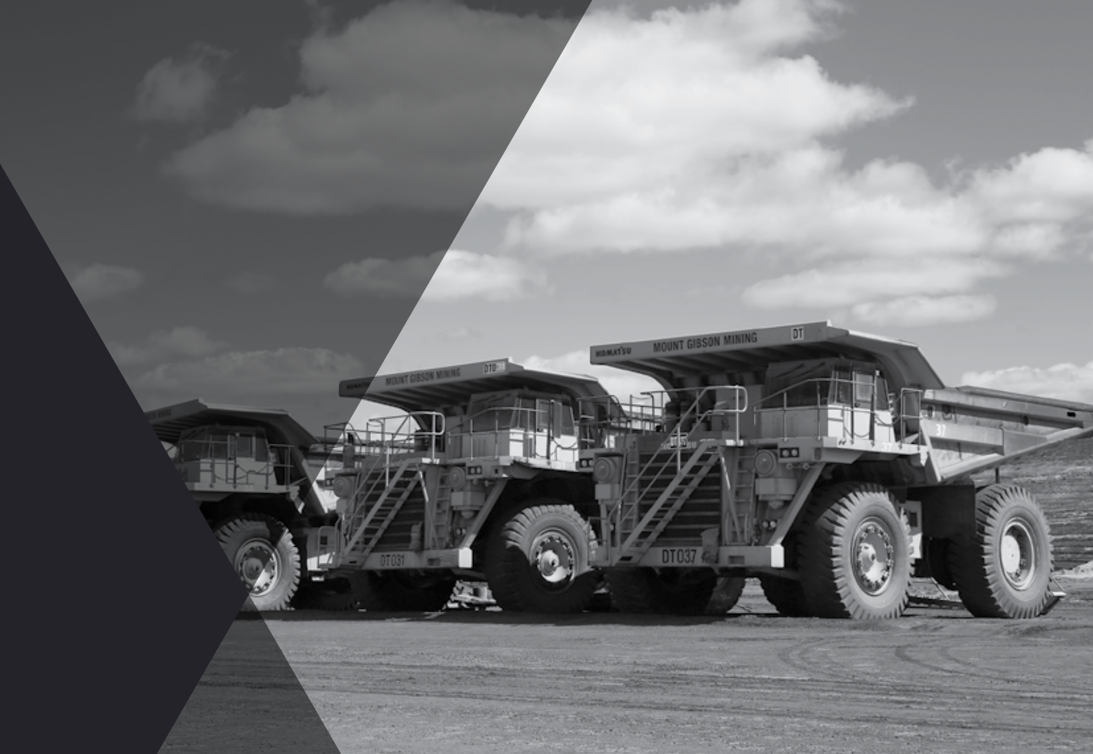
Haul trucks, Talling Peak