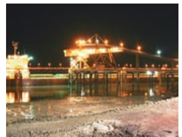
Koolan Island wharf

Our strong financial position, healthy sales outlook, capable team and our demonstrated ability to deliver business improvements position Mount Gibson well for the future.