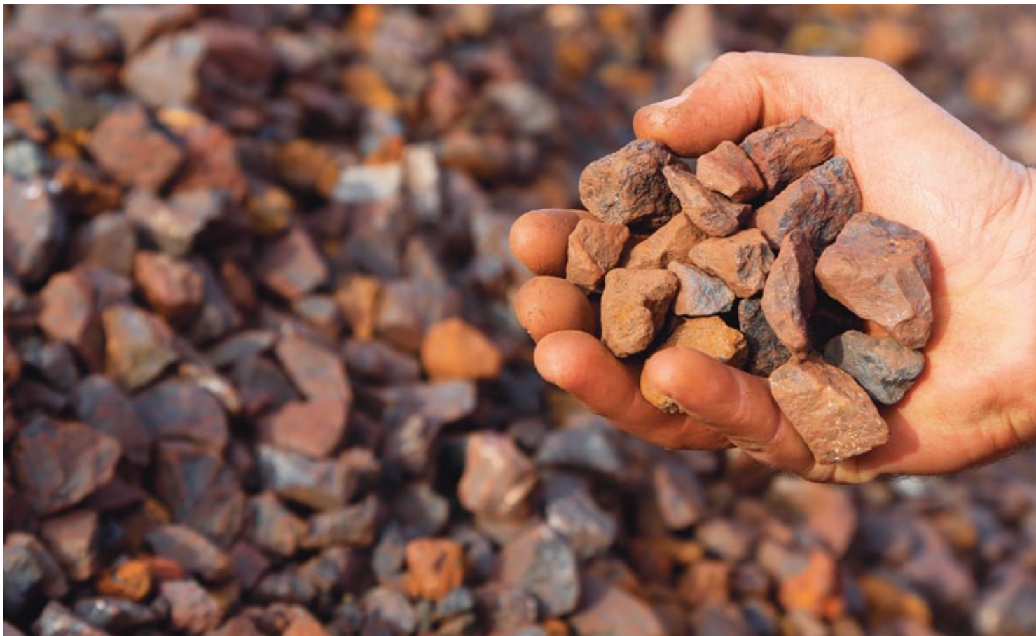
High grade lump ore from Mount Gibson's Mid West operations

It is of great credit to our Talling Peak team that the mine not only delivered better than expected ore sales in its final