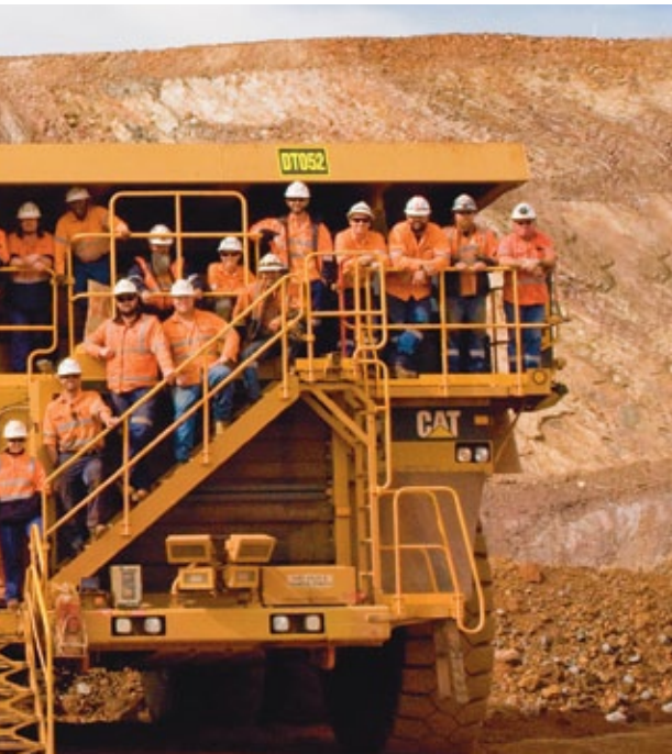
Talling Peak end of mining celebrations

The ramp-up is on track with productivity levels improving substantially, and unit cash mining costs reducing over the year. We are expecting further reductions to be realised in the year ahead from our strategy of pursuing continuous improvement. This is fundamental to our strategy at Koolan, where we are investing substantial capital in pre-stripping over the next two years to position the operation for extremely low cash costs thereafter.