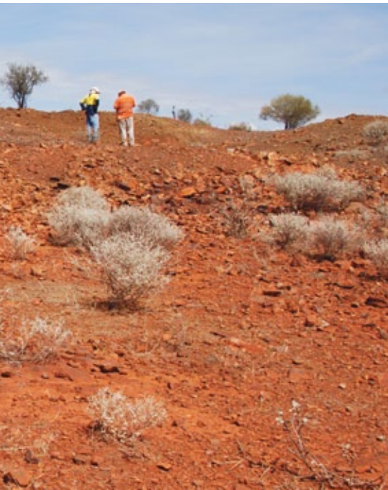
Site reconnaissance at Fields Find

In August 2014, Mount Gibson announced it was reviewing the development schedule for Shine in light of prevailing iron ore prices and currency exchange rates, and the planned completion of updated Mineral Resource and Ore Reserve estimates incorporating the data from newly completed RC and diamond drilling. Consequently, the development of Shine was deferred to allow the Company to evaluate the updated geological information and further optimise the development plan and schedule.