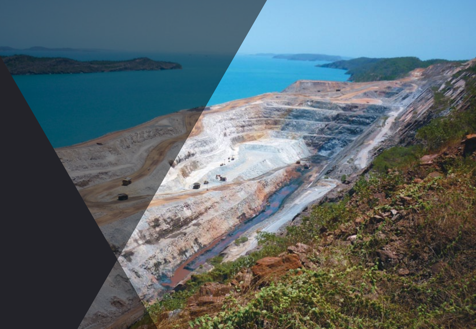
Koolan Island Main Pit