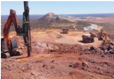
Mining at T1 deposit, Tallering Peak

year, but did so while also reducing costs and setting a new site safety record. This site record was especially pleasing and encapsulates our objective of constantly improving our safety performance.