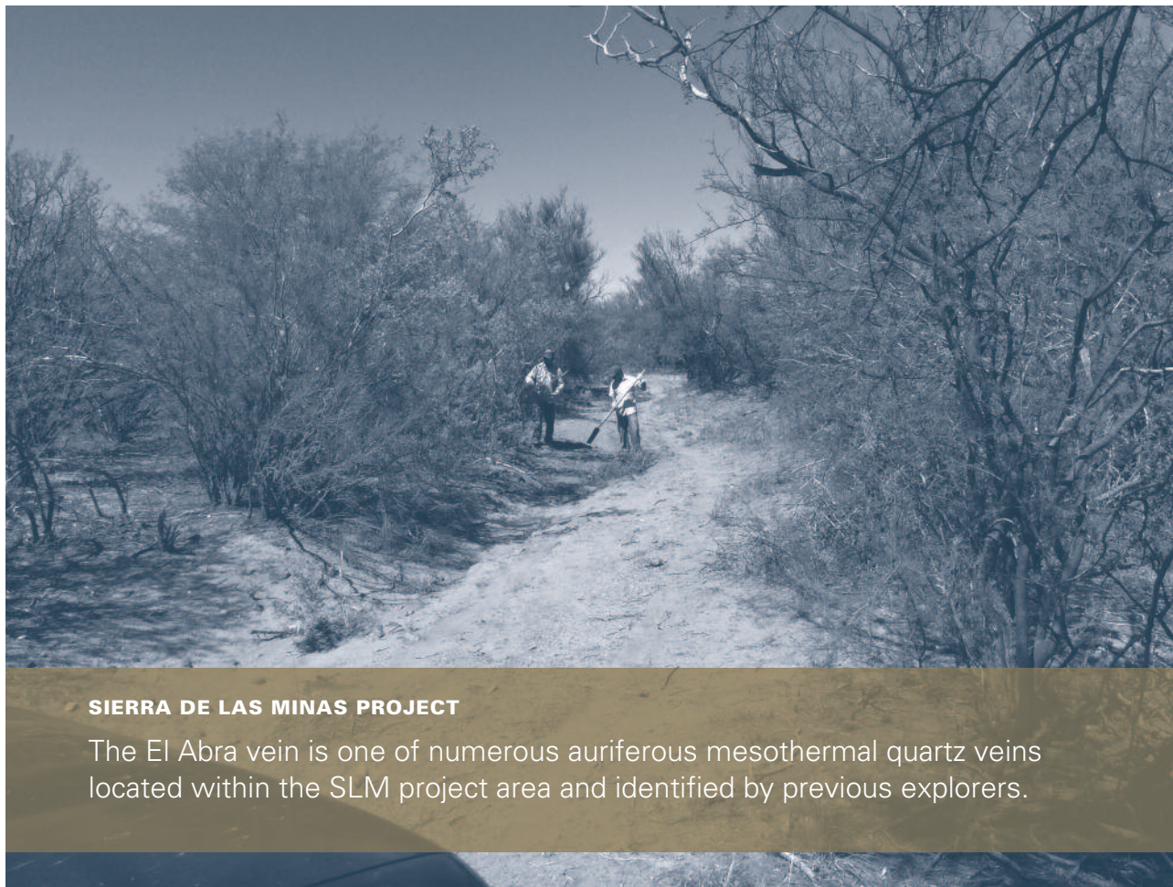
Above, establishing exploration access in the southern portion of the SLM gold project area, Argentina