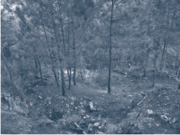
THE PHILIPPINES THE ITOGON PROJECT IS LOCATED WITHIN AN INTERNATIONALLY RENOWNED GOLD AND COPPER MINING DISTRICT