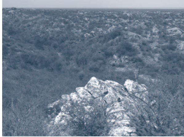
ARGENTINA THE EXPLORATION STRATEGY FOR THE SLM PROJECT IS TO IDENTIFY MULTIPLE HIGH GRADE LOW TONNAGE GOLD RESOURCES

However superficially attractive a large and diverse project portfolio may be, we are critically aware of the danger of overstressing ECR's resources, whether management time or finances. Our two current projects offer significant opportunity, subject to success on the ground, for shareholder value creation. We are also aware that the distressed mineral sector environment of recent times has helped to create some potentially attractive opportunities. Accordingly we continue to review and assess potential new projects in line with our published project selection criteria, and may engage further if any of these are deemed sufficiently attractive.