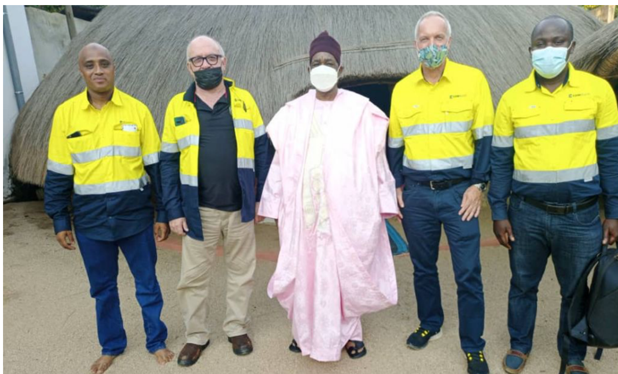
Figure 2: Camalco management team with the Lamido of Ngaoundere at his traditional Palace