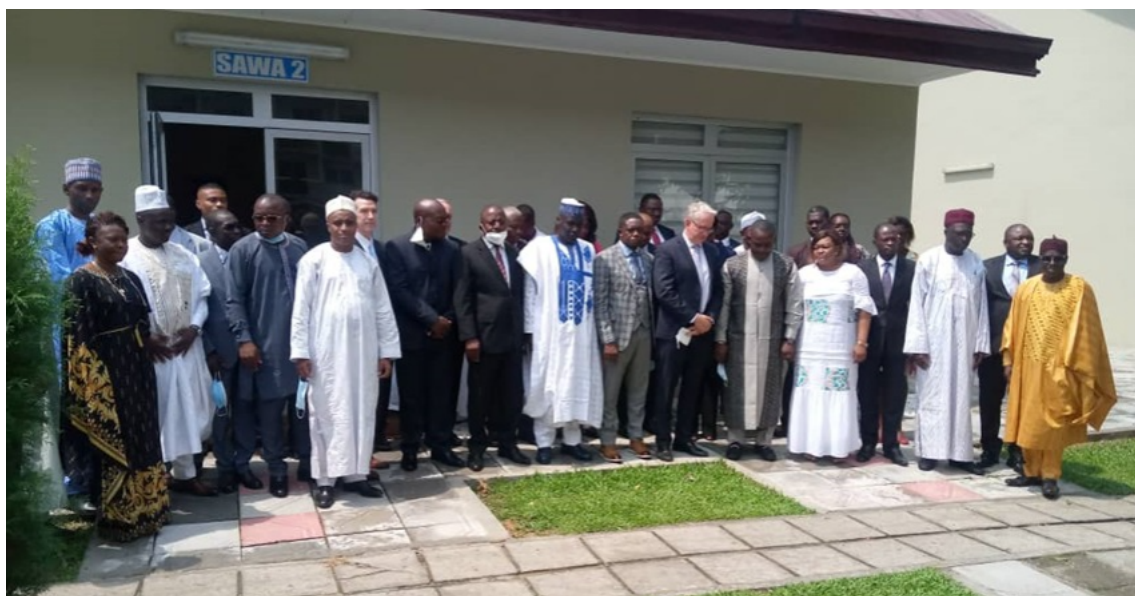
Figure 1: Canyon and Cameroon ministry negotiation teams at the Hotel Sawa, Douala Cameroon, January 2022

In January 2022, Camalco completed all negotiations with the relevant Government Ministries to finalise the terms of the Project Mining Convention. The terms of the Mining Convention were signed off by the 15 relevant Ministries who attended the negotiation meetings. The Mining Convention was reviewed by the Ministry of Mines and forwarded to the office of the Prime Minister of Cameroon for approval before execution.