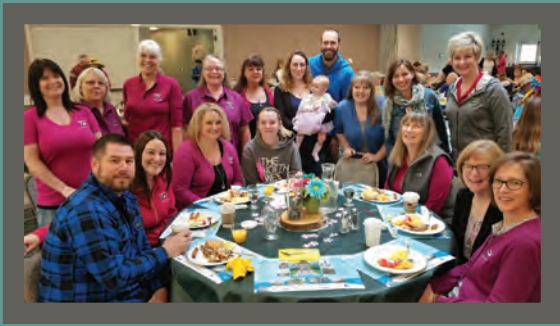
North Olympic Peninsula employees and family members gather at the 123rd Irrigation Festival Crazy Daze Breakfast. The Irrigation Festival is the longest running festival in the State of Washington.