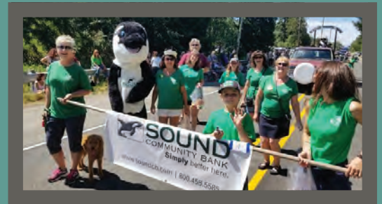
Just west of Port Angeles is Joyce, a small community which celebrates wild blackberries each year while supporting scholarships for high school students and providing funds for local emergency services. We proudly marched in the Joyce Daze Parade last August.