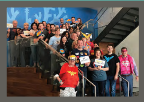
Employees at Sound Community Bank's Administrative offices join forces during Food Frenzy's Superhero Day, raising funds to stock food shelves at Food Lifeline's distribution center.