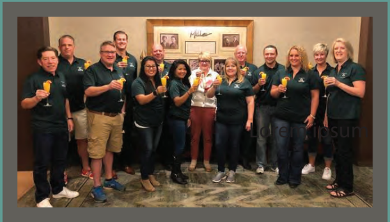
Now in its third year at Sound Community Bank, the Producers Club is an elite group containing individuals with top retail and loan sales throughout the year. They toasted another successful year at Suncadia Resort!