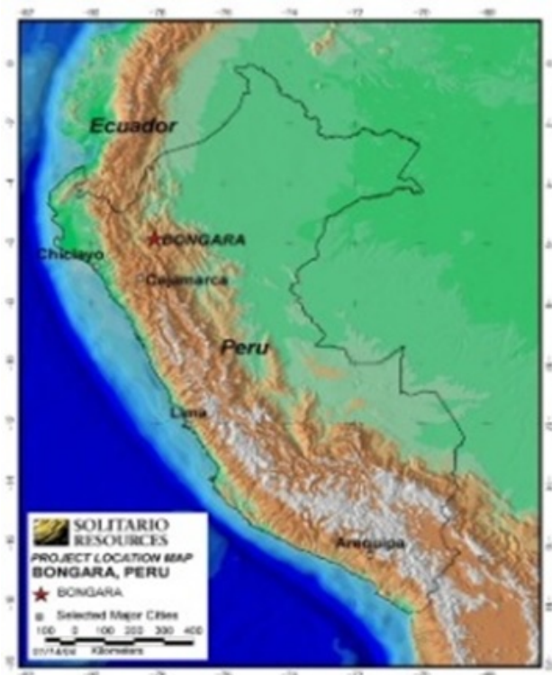
(Map of Florida Canyon Property, formerly Bongará)

On August 15, 2006, Solitario signed a Letter Agreement with Votorantim Metais Cajamarquilla, S.A., a wholly-owned subsidiary of Votorantim (now known as Nexa) (both companies are referred to in this Item 2 as "Nexa") on Solitario's 100%-owned Florida Canyon zinc project (formerly called the Bongará project). On March 24, 2007, Solitario signed the Framework Agreement with Votorantim for the Exploration and Potential Development of Mining Properties (the "Framework Agreement"), pursuant to, and replacing, the Florida Canyon Letter Agreement. In 2015 Votorantim transferred its interest in the Florida Canyon project to Milpo, an 80%-owned affiliate of Votorantim. In October of 2017, Milpo and Votorantim merged to form Nexa. Nexa is listed on the NYSE under the trading symbol "NEXA" and the TSX under the trading symbol "NEXA." For the remainder of this Florida Canyon property section, all references to Votorantim, Milpo or Nexa are collectively referred to as Nexa.