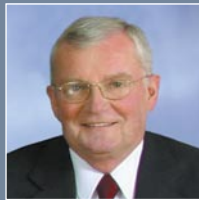
John M. Shalikhshvili