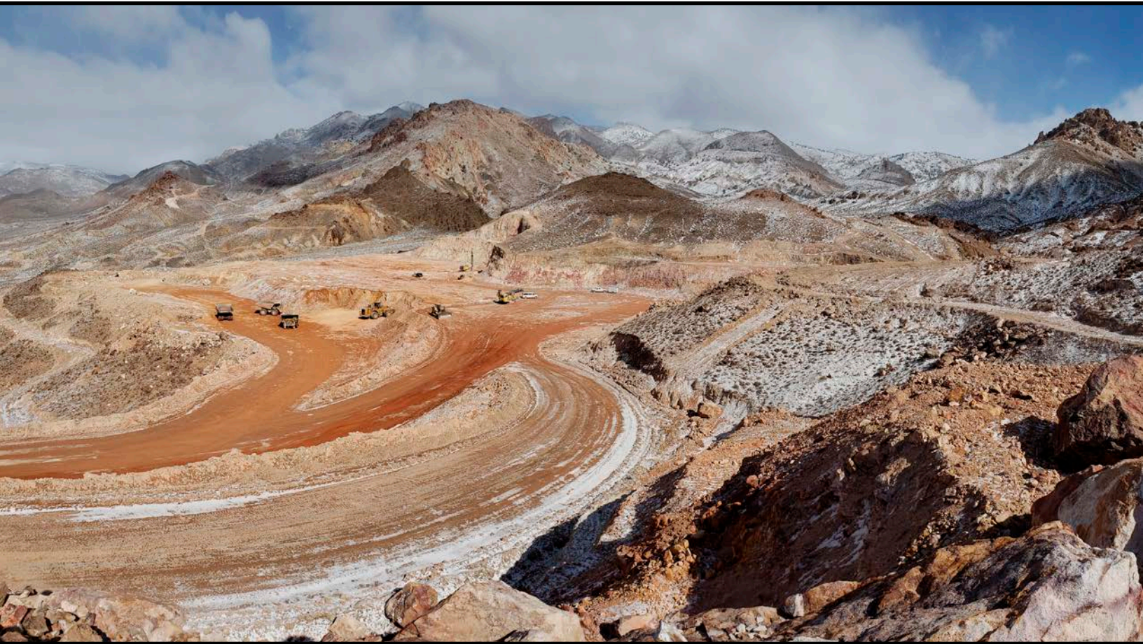
Isabella Pearl, Nevada Mining Unit