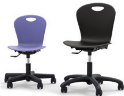
ZTASK15 Grade 1-4