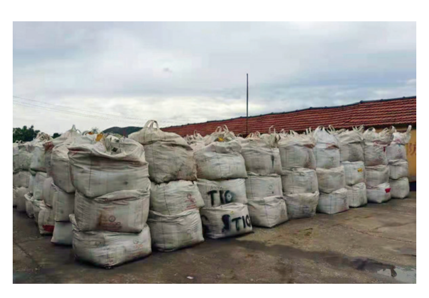
500 TONNE MAHENGE BULK SAMPLES ARRIVE FOR POSCO SUPPLY CHAIN QUALIFICATION TEST WORKS

Black Rock Mining holds the view that there is little value in sending our Graphite concentrate down the supply chain to make batteries that go into electric vehicles, if the process to do that is not as green as the intended benefit that electrification of transport represents. This is why the partnership with Urbix is so important in delivering significant environmental and economic benefits to our stakeholders and that of all stakeholders across the whole battery anode supply chain. This marks our desire to further differentiate our supply chain from competing brands.