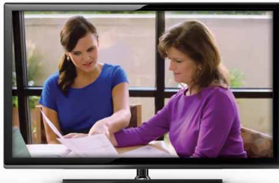
Through the Door ®, our DR-TV spot, featured rotating offers that helped members find their healthy centers.

In late 2013, we added five new Centers through franchisees.