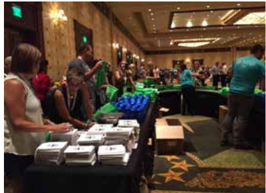
Medifast® introduced Take Shape For Life® Cares, a charitable effort whose main objective is to give back to underprivileged communities through an association with organizations which align with Take Shape For Life's mission of Optimal Wellbeing™.