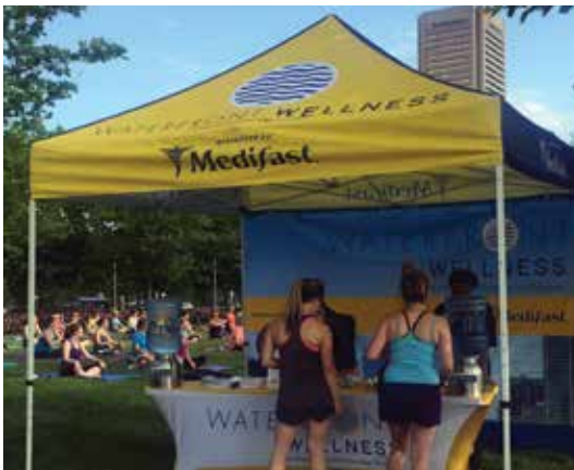
Medifast® sponsored Waterfront Wellness, a series that brought free fitness classes to the Baltimore waterfront throughout weekends in the summer months.

We know that our journey to Optimal Wellbeing™ is tied to the wellbeing of our community. In 2016, we were committed to giving and serving in order to see our communities reach their fullest potential.