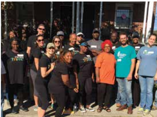
Medifast® served in partnership with Rebuilding Together Baltimore to help a neighbor who needed critical repairs to her home.