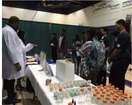
Medifast® participated in Junior Achievement's annual STEM Summit, where employees in food science and nutrition spoke to a group of high school students.