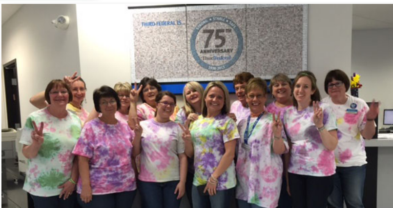
Our Brunswick branch associates show their true colors during Fun at Third Federal Month.