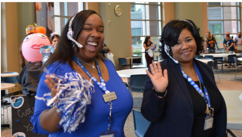
A 5% turnover rate ensures happy, productive associates who in turn provide the best customer service in the industry.