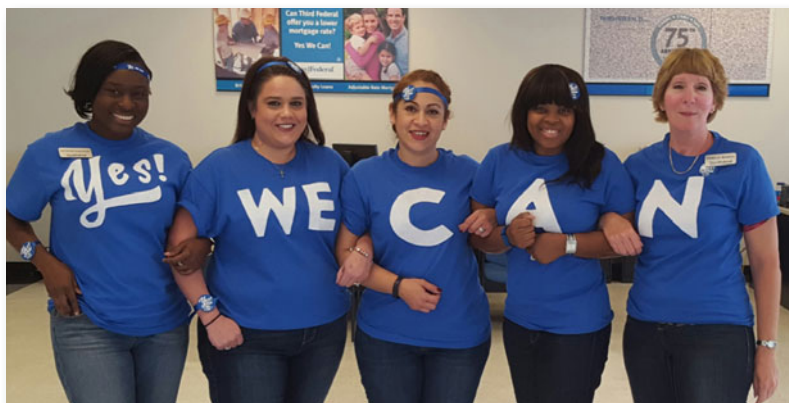
Our Coral Springs branch associates celebrate our Yes! We Can customer service spirit.